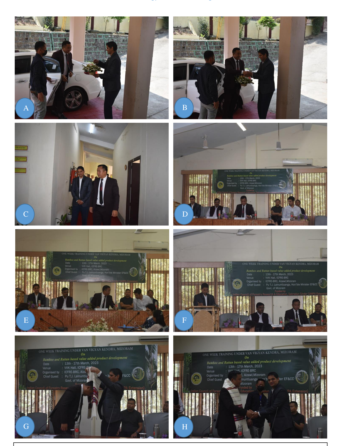
Figure 1: A - H: Welcome Address & Felicitation of Guests.