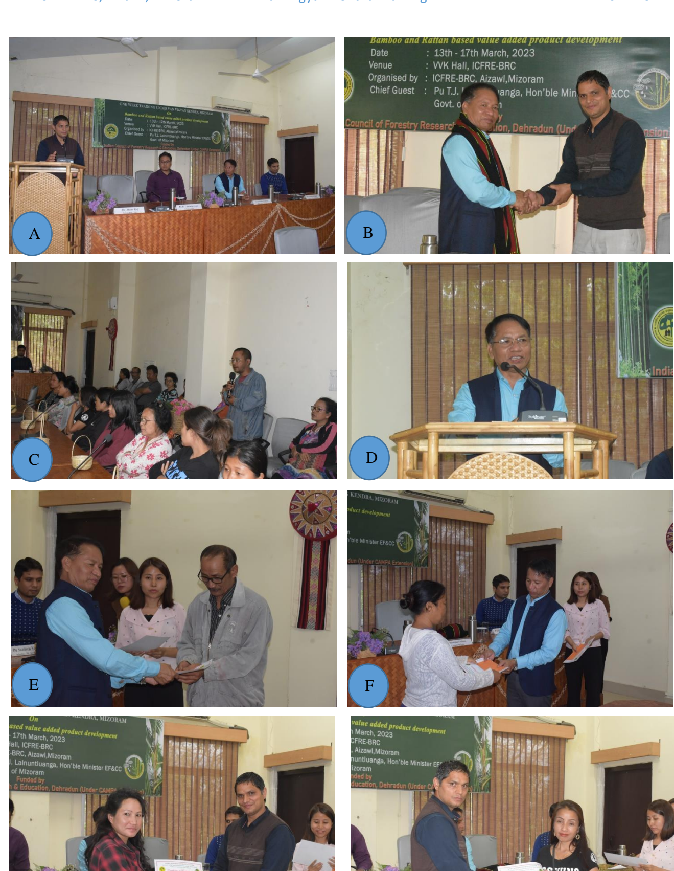
Figure 6: A-H: Felicitation of Chief Guest, Valedictory Speech by Chief Guest, and Distribution of Certificates.