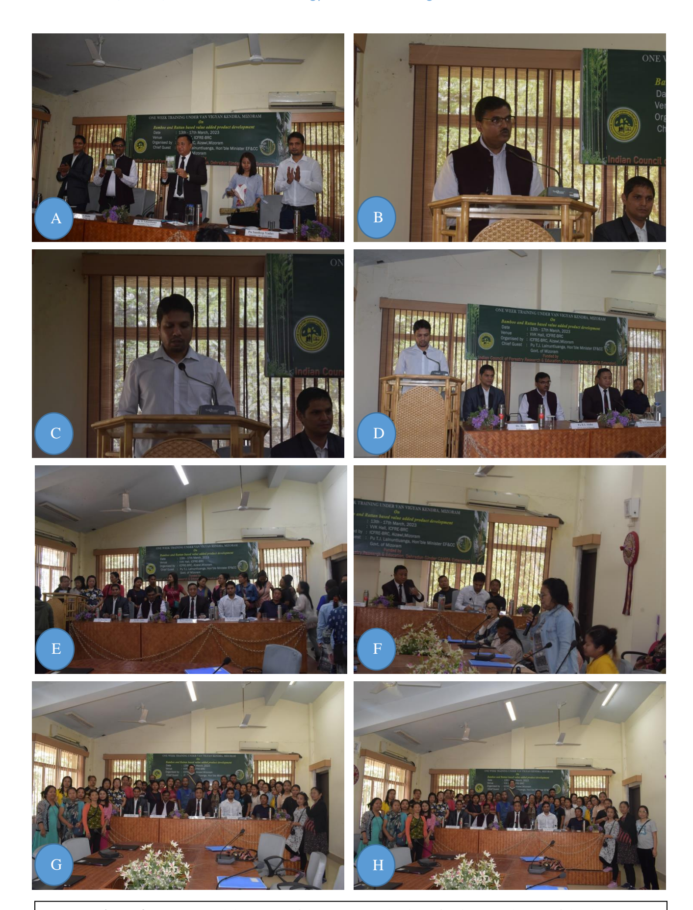
Figure 3: A-H: Speech by Guest of Honour, Introduction of trainees and Vote of thanks.