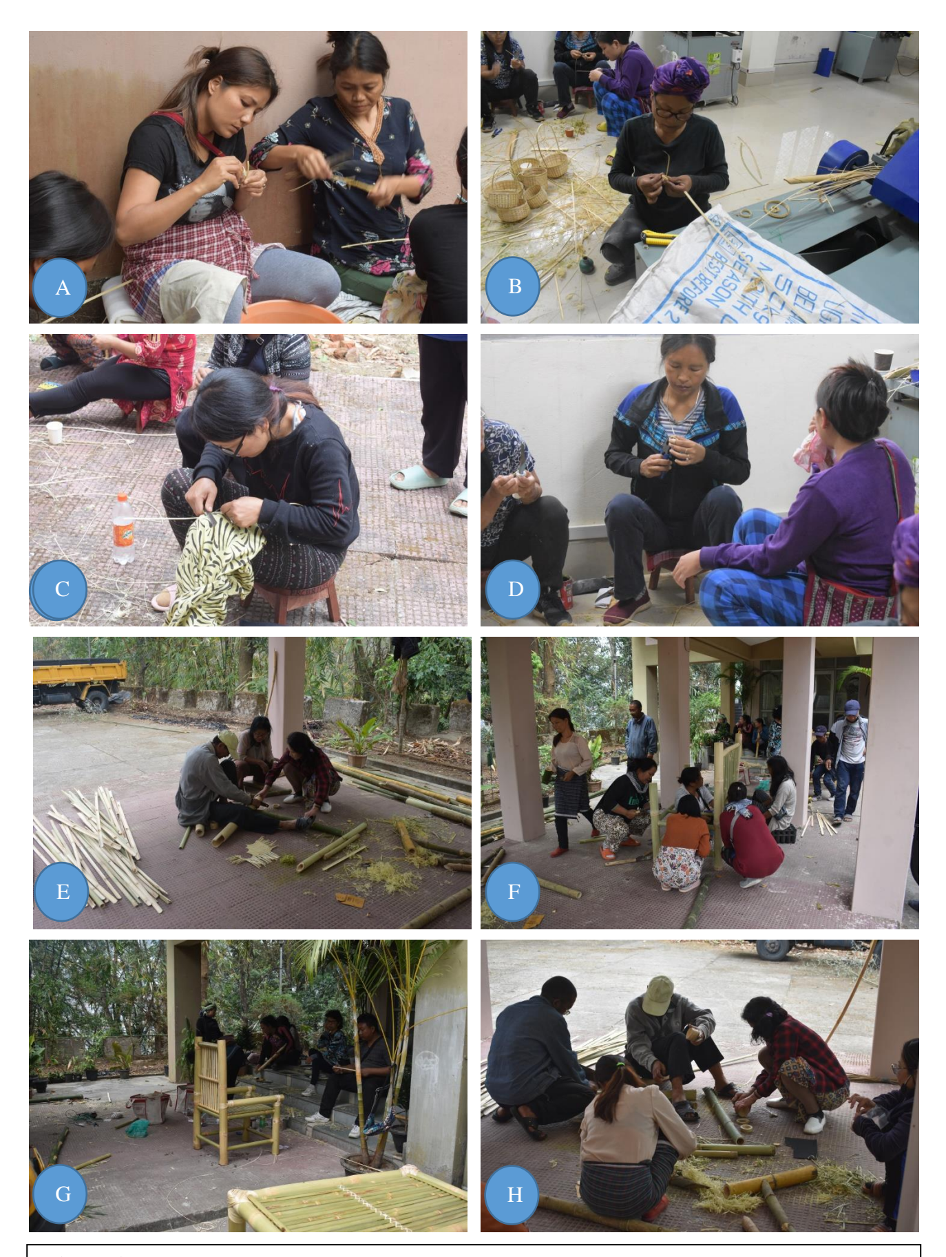
Figure 4: A-H: Hands on training on bamboo and rattan based value added product development