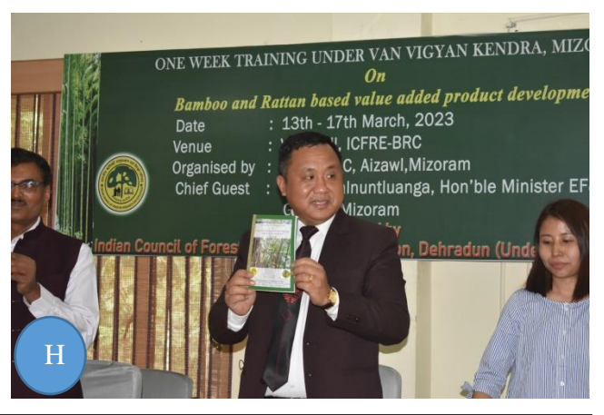
Figure 2: A-H: Felicitation of Guest of Honour, Inaugural speech by Chief Guest, release of ICFRE-BRC Report-1 on Chimonocalamus lushaiensis