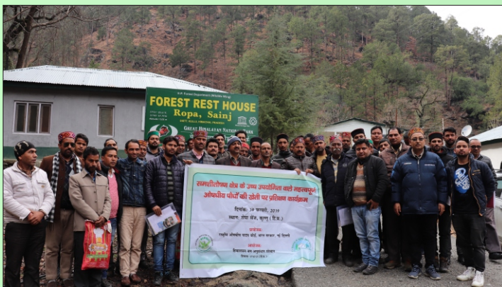
Training on cultivation of important high value temperate medicinal plants