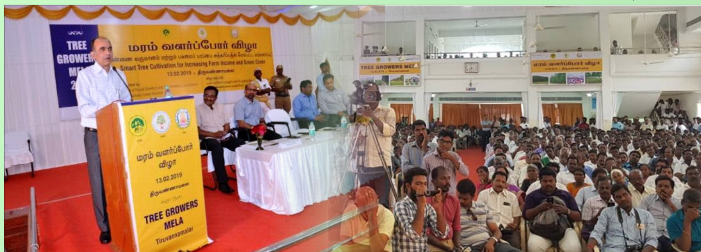
Tree Growers Mela at Tiruvannamalai, Coimbatore