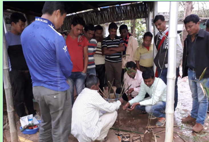
Training on Development and Management of Bamboo Kisan Nurseries