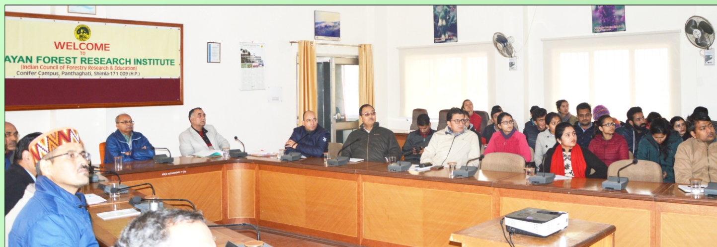
Monthly Seminar on Eco-restoration of degraded areas of Cold Deserts in Himachal Pradesh and Jammu & Kashmir