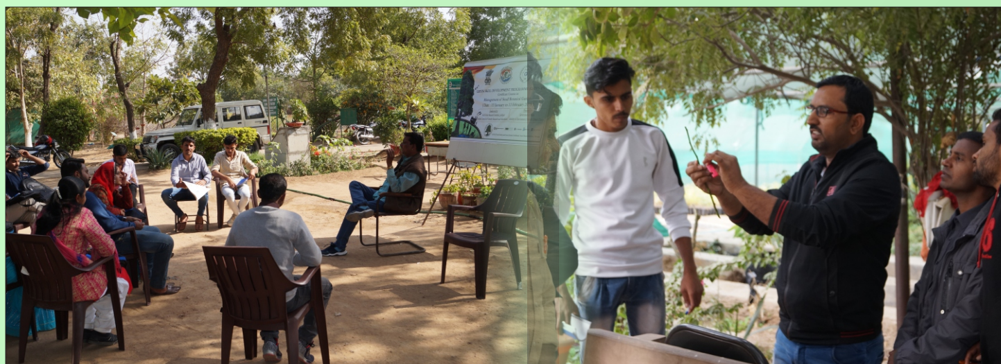
Training on Management of Small Botanical Gardens