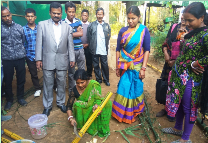
Training on Bamboo propagation and Nursery Management