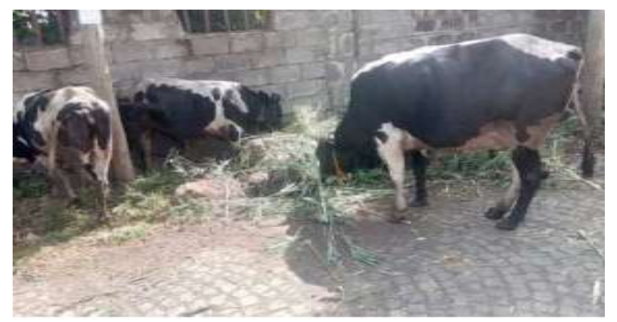
Fig. 1: Bamboo leaves were lopped and feed to cattle

goats in central Appalachia. Bamboo maintains nutritive value and remains green during winter thus considered as potential winter forage for goats in cooler areas.