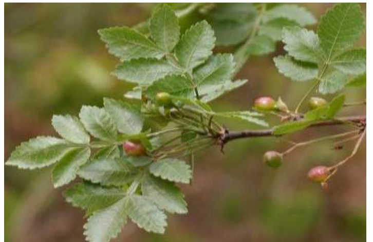
Fig. 1: Tree branch showing leaf and fruits of Bursera penicillata

It is native (often for many species endemic) to the Central America (from South Mexico down to Peru) (Espinosa et al., 2006). It is an aromatic essential oil plant introduced into India by two private enterprising Scotsman in 1912 Thatgunni estate near Bangalore, at Karnataka State. But Karnataka state forest department has started it's cultivation since 1958 (Ashok et al., 2015). Even then also the cultivation is very much restricted to Bangalore region only and it also distributed in Tamil Nadu and Odisha region.