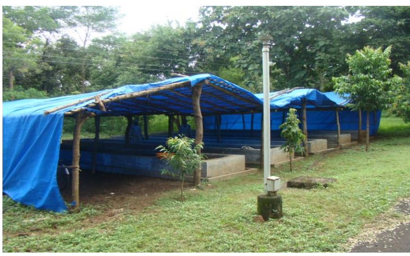
Overview of Vermicompost unit of TFRI