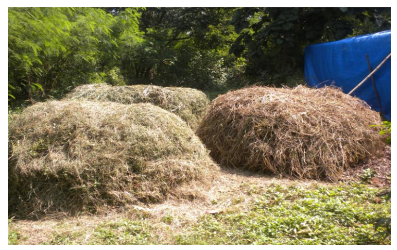
Dry grass/ leaf litter for production of vermicompost