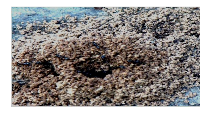
Fig.6. Predator ant, Camponotus compressus on sal borer Oecophylla smaragdina Fabricius (Hymenoptera : Formicidae)

The red tree ant or weaver ant, Oecophylla smaragdina, is one of the ants living in colonial nests in the foliage of trees (Beeson, 1941). This ant is widely distributed in the old world tropics (Browne, 1968). The nest is constructed by drawing together in to a branch the leaves of several adjacent shoots. It possesses long and formidable mandibles and inflicts their sharp bites if interfered. The presence of ant colonies is a nuisance to workers in the forest, particularly in forest areas, owing to the painfulness of the bite and their readiness to attack (Beeson, 1941). This insect is of some value as predator, killing their prey by stretching their appendages (Browne, 1968). 0. smaragdina has been used for centuries in China and Java for the biological control of insect pests of fruit trees, although its efficacy for this purpose is very dubious.