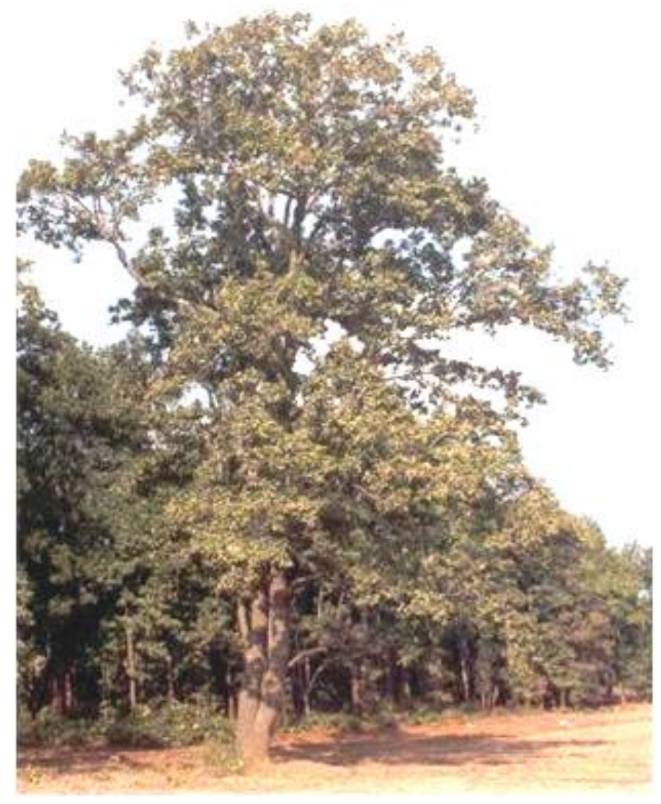
Fig.1. Sal tree

Sal heartwood borer, Hoplocerambyx spinicornis Newman (Coleoptera : Cerambycidae), commonly known as sal borer (Fig. 2), needs no introduction, because of the fact that this destructive insect is very well known to forest entomologists, scientists, officers, frontline staff of forest department and forest dwellers residing in close proximity of sal forest areas. Sal entomology has received special attention, since inception of