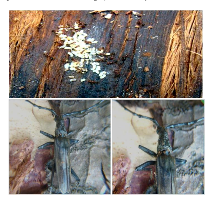
Fig.5. Predator ant, unidentified small red ant on eggs and adult beetle of sal borer