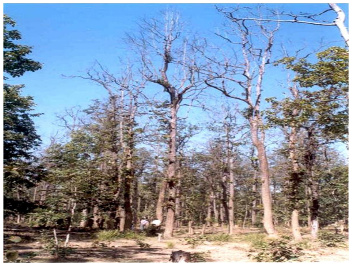
Fig.3. Sal borer damaged forest

Regarding the natural enemy complex of sal heartwood borer, information is scanty, apparently, there are not many (Nair, 2007). However, natural enemies consisting of parasitoids, predators and pathogens play an important role to influence the population of sal borer (Roychoudhury al., 2013). et Roychoudhury (2016, 2017) have recorded a total of seven natural enemies of H. spinicornis in sal forests and timber depots, out of which one species is larvalpupal parasitoid and six species are