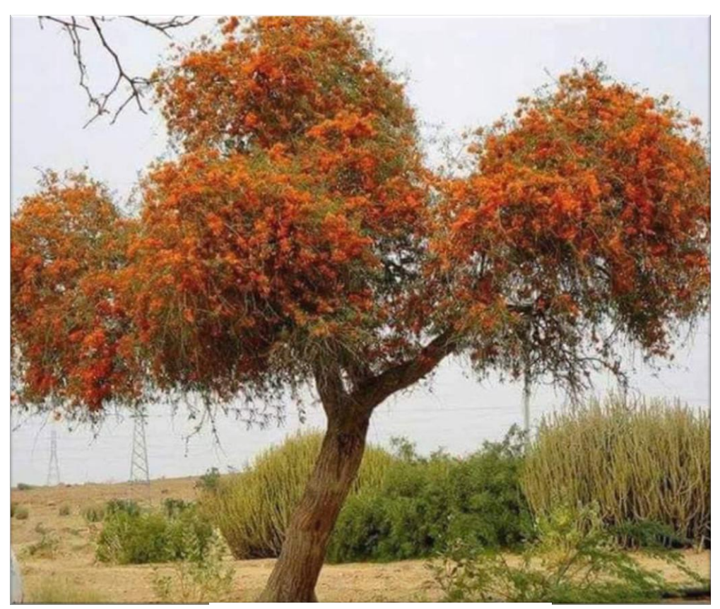
Fig. 1 Tecomellaundulata tree

after that. Fruit is a capsule 15-35 cm 9 8-10 mm long, curved, linear-oblong, smooth, with thin valves. Seed winged and measure 2-2.5 cm (9 9-10 mm). The wood is greyish or yellowish brown, closegrained, with light streaks, and is tough, strong, and long-lasting.