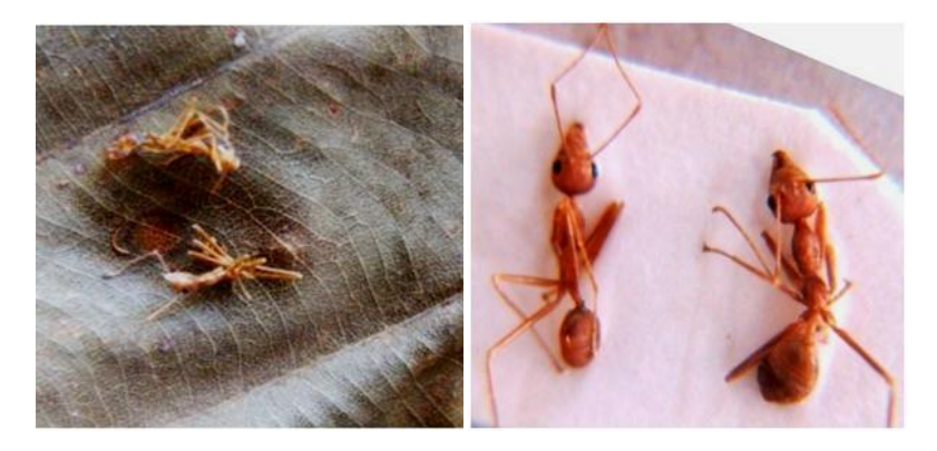
Fig.4. Predator ant, Oecophylla smaragdina on sal borer