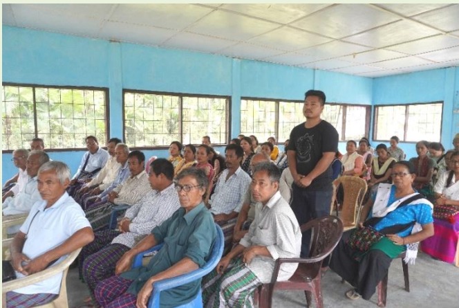
Interaction by the villagers