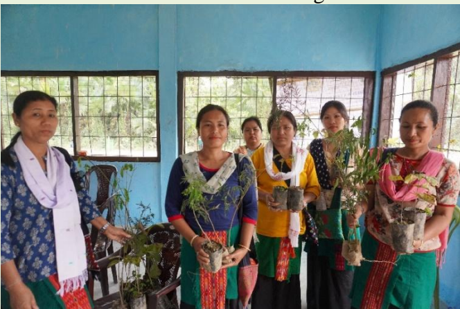
Distribution of seedlings-III