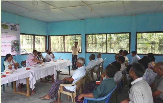
Discussion by the Villagers