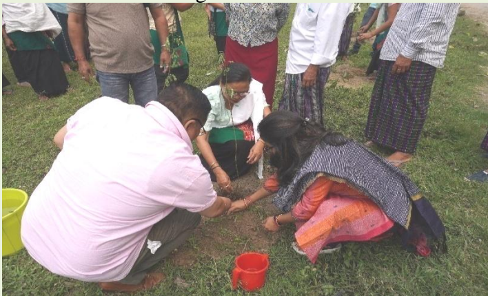
Seedling planted by DFO, Namsai