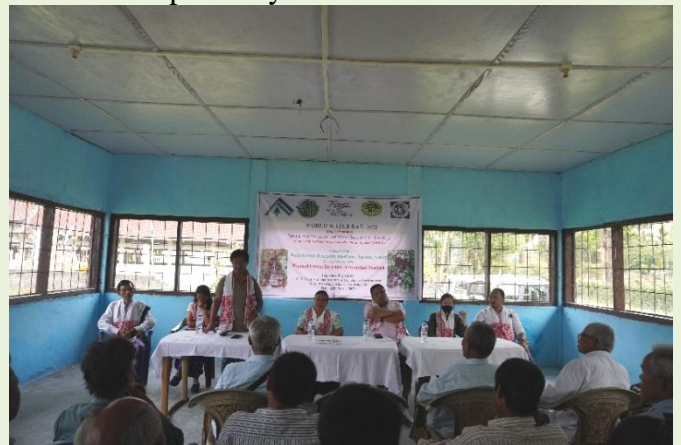
Speech by ADC (Guest of Honour)