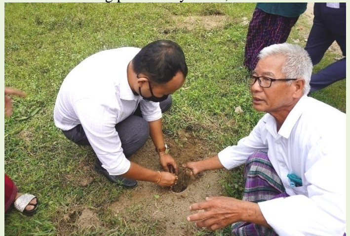
Seedling planted by Circle Officer, Madhavpur