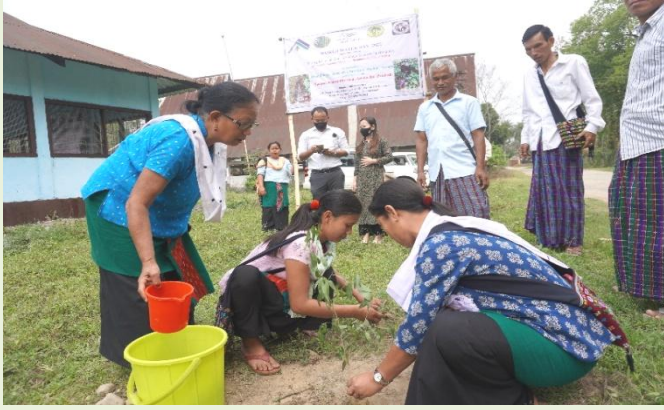
Seedling planted by Villagers, Namsai