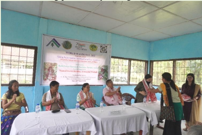
Felicitation of the Guests