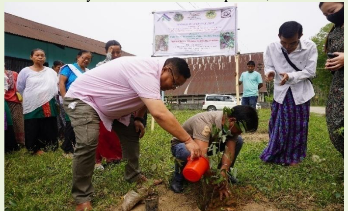
Seedling planted by ADC, Namsai