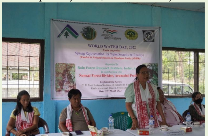
Speech by Zilla Parishad Chairperson (Chief Guest)