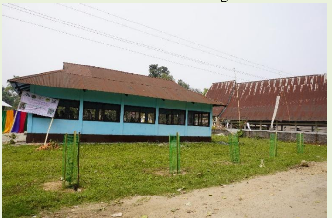
Guard fencing around the seedlings