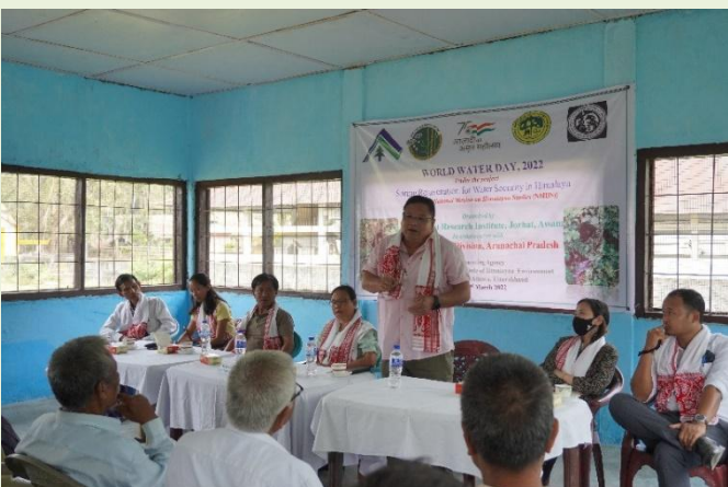
Speech by DFO (Guest of Honour)