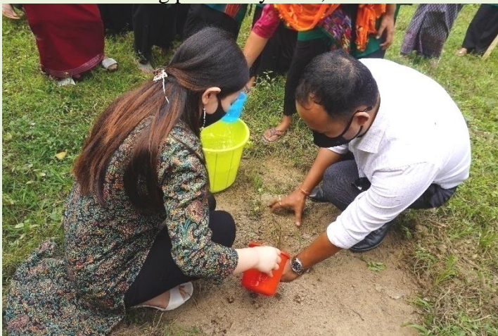
Seedling planted by Circle Officer, Lathao