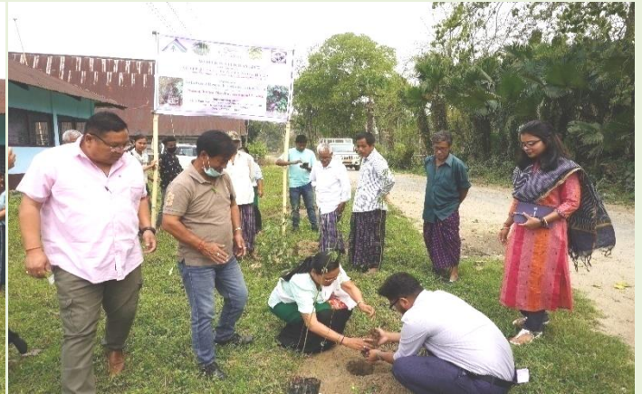
Plantation by Zilla Parishad Chairperson, Namsai