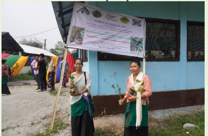
Distribution of seedlings-II