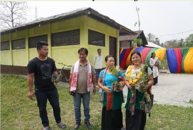
Distribution of seedlings-I