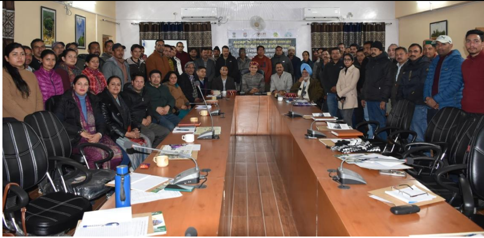
Group photo of participants