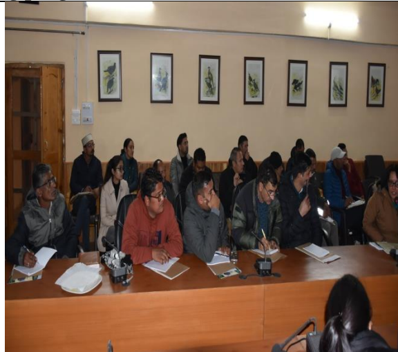
Participants during interaction with experts