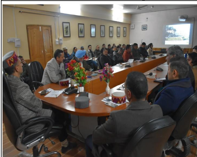
Participants during Training programme