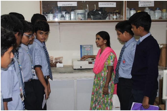
Figure-7: Soil laboratory & research outcomes demonstration by ICFRE-IFB, Staff