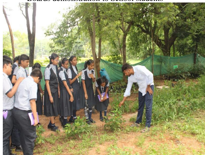
Figure-6: Medicinal plants demonstration by ICFRE-IFB, Staff