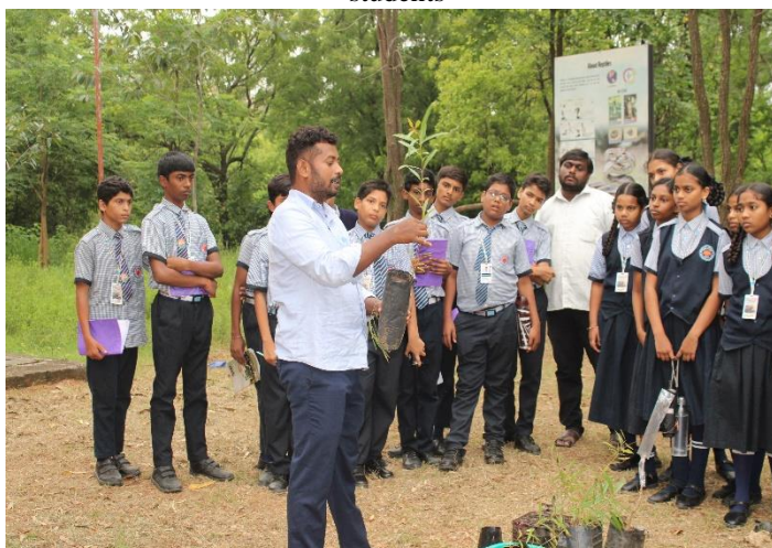
Figure-5: Nursery techniques demonstration by ICFRE-IFB, Staff