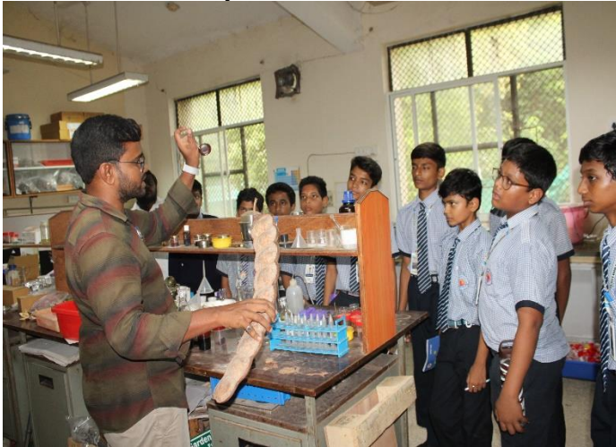
Figure-9: NTFP laboratory & research outcomes demonstration by ICFRE-IFB, Staff