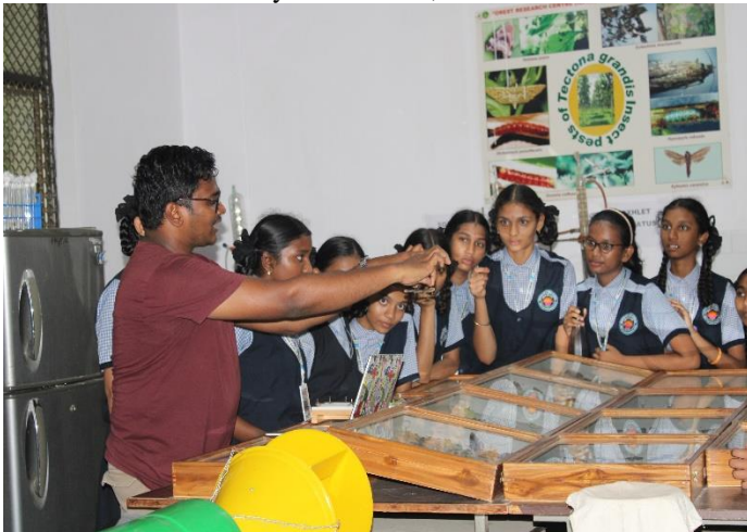
Figure-11: Entamology laboratory & research outcomes demonstration by ICFRE-IFB, Staff