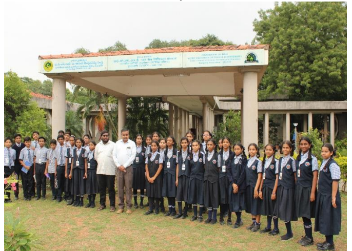
Figure-12: Prakriti program Guorp photo