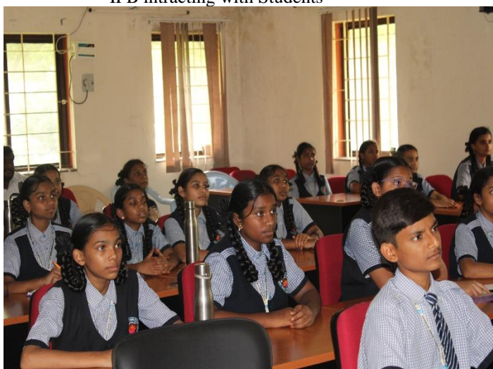
Figure-3: Institute Video Documentary Presentation to School students