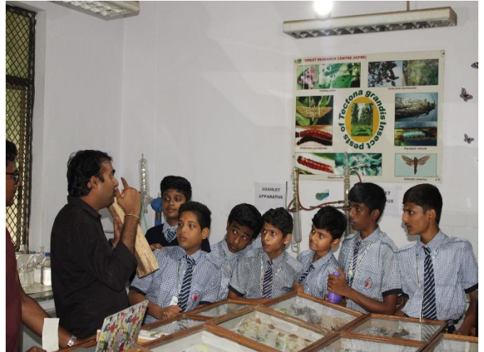
Figure-10: Entamology laboratory & research outcomes demonstration by ICFRE-IFB, Staff