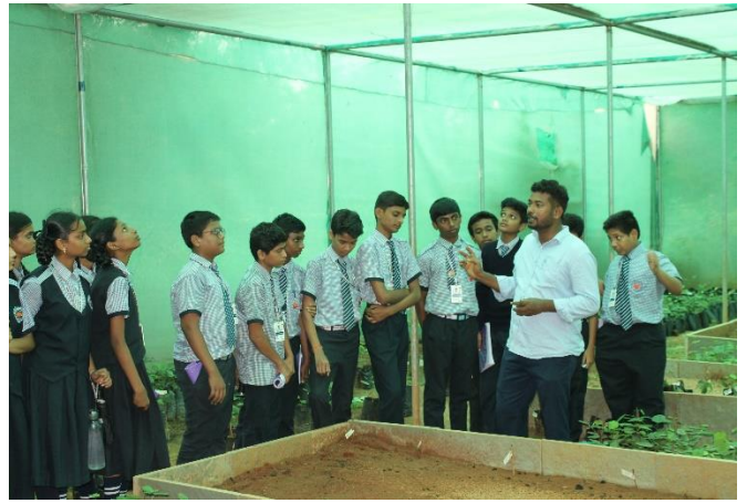
Figure-8: Nursery techniques demonstration by ICFRE-IFB, Staff