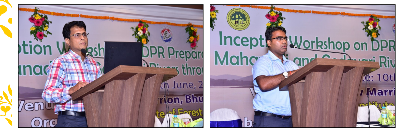
Presentations in the Interactive session during the Workshop