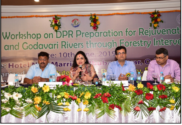
The valedictory session during the Workshop