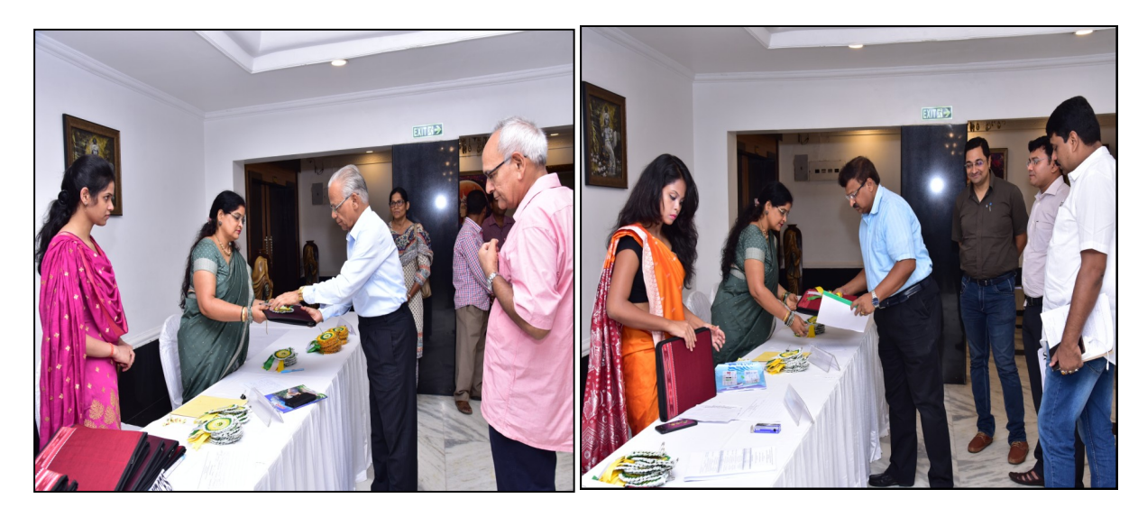
Registration of delegates