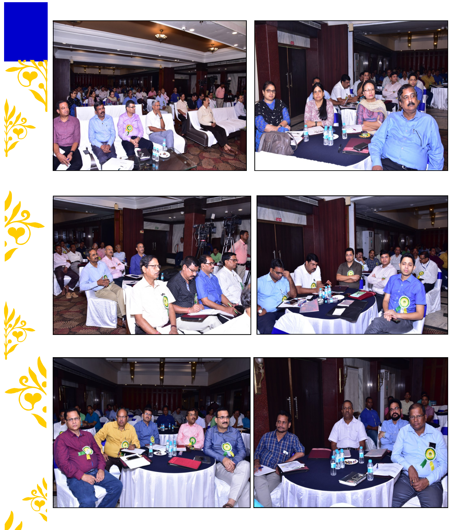
Delegates at the Inception Workshop