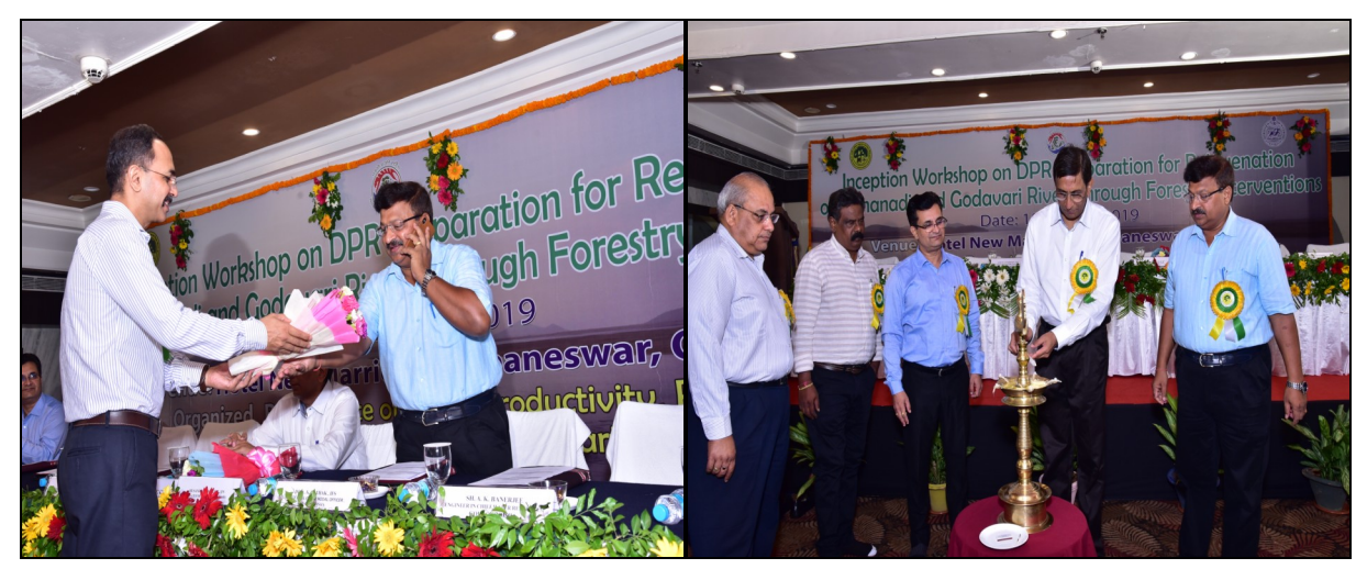
Welcome of guests and lighting of lamp