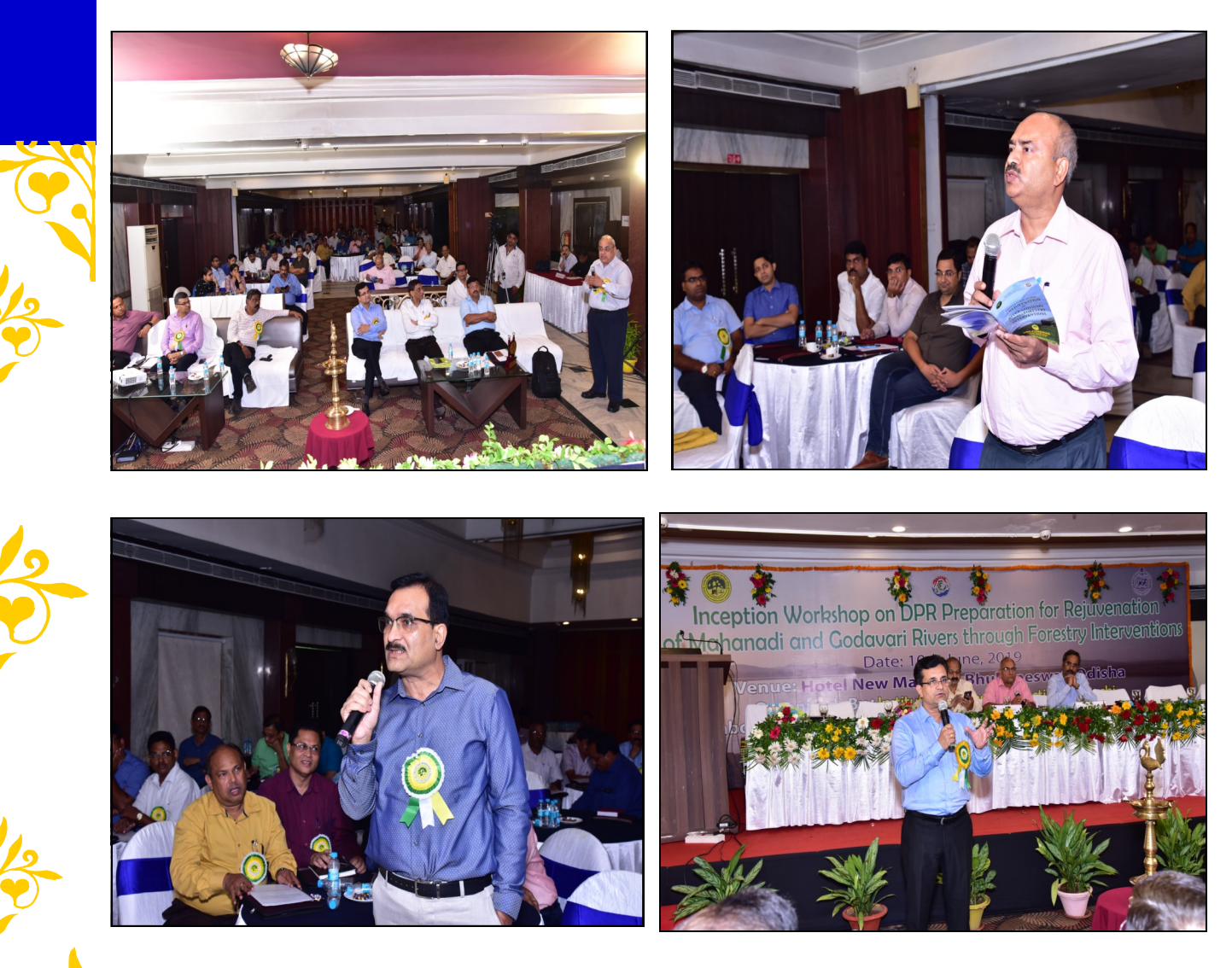
Deliberations and interactions during the Workshop