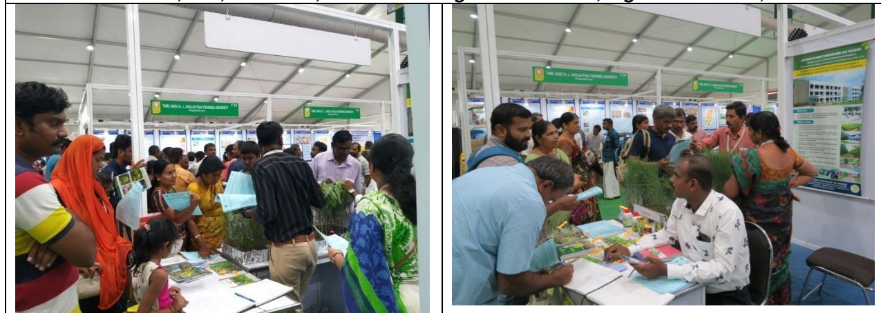
Visitors discussing with IFGTB team on the technologies at IFGTB stall