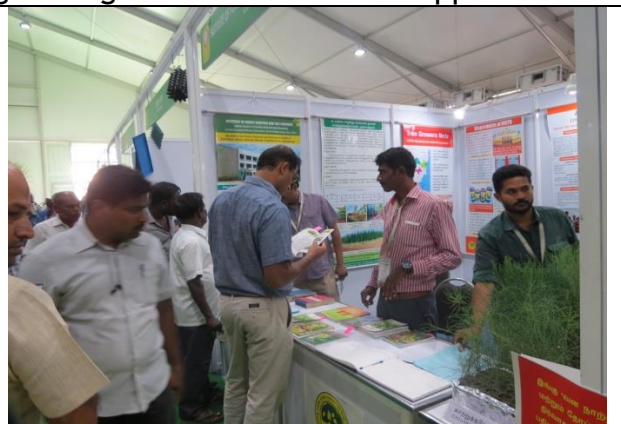
Visitors observing products and publications of IFGTB