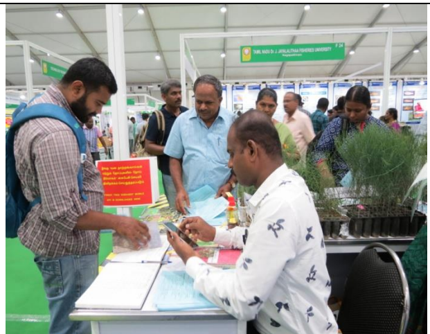
Participants in discussion and registering IFGTB-ENVIS Mobile App