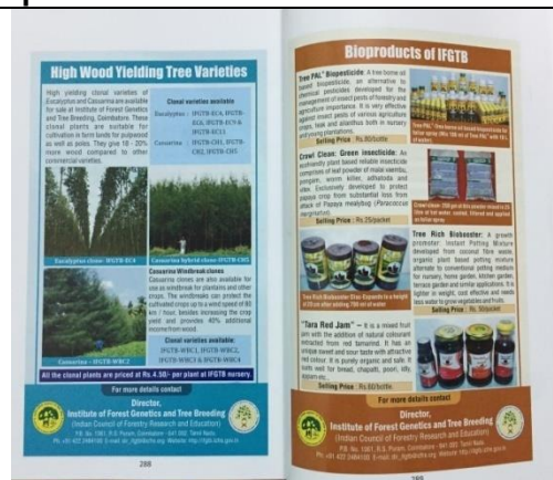
Advertisement released by IFGTB in the FAIR Directory