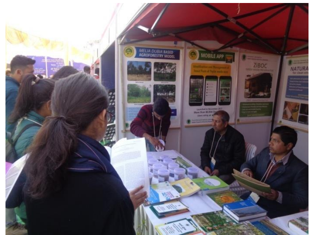
Visitors at Exhibition Stall of FRI