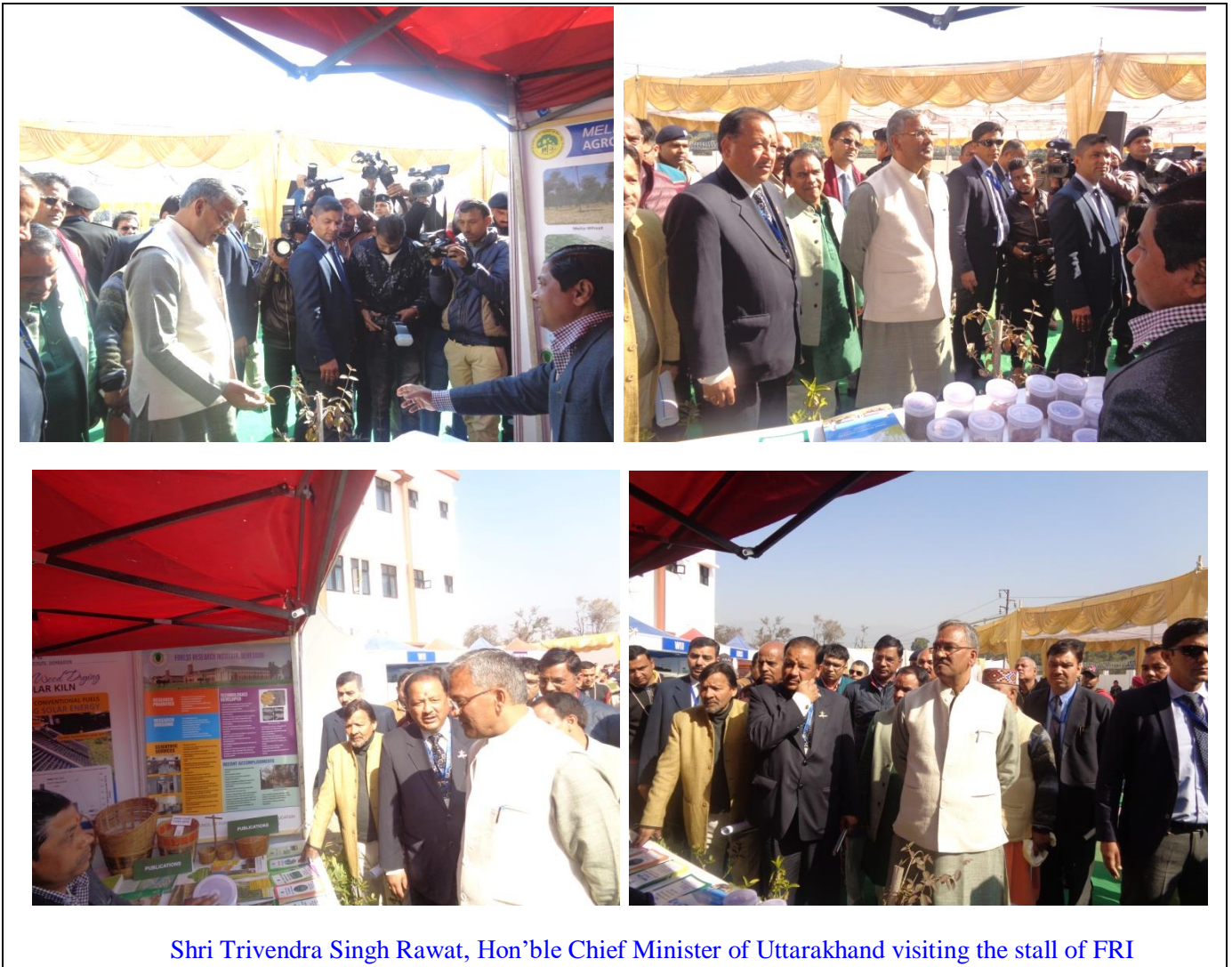
Shri Trivendra Singh Rawat, Hon'ble Chief Minister of Uttarakhand visiting the stall of FRI