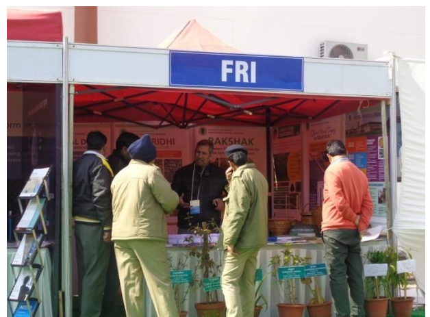
Visitor visiting the Exhibition stall of FRI