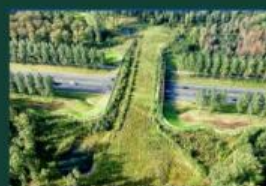
Protect wildlife and their corridors