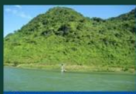
Maintain and enhance natural ecosystems within landscapes