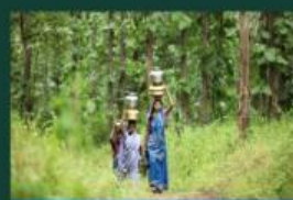
Empower local communities