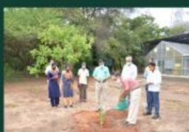
Plant more trees