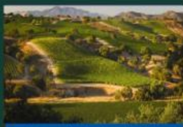
Ensure land sustainably