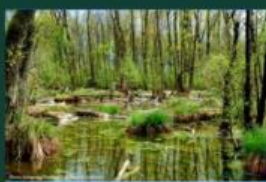
Restore multiple functions for multiple benefits