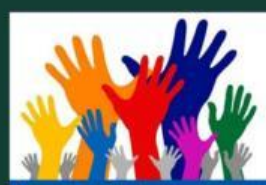
Engage stakeholders and support participatory governance