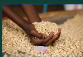
Strengthen seed production capacities