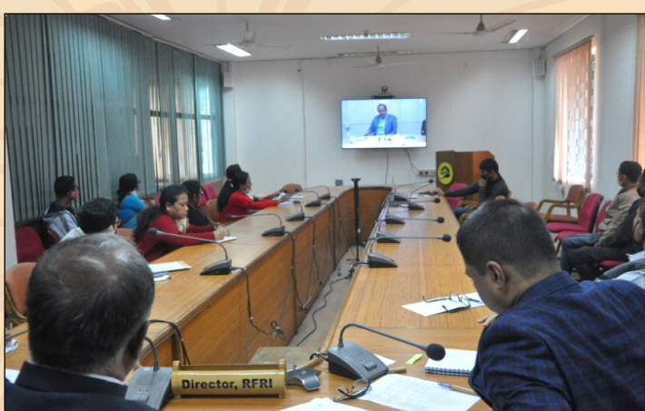
Training on Bamboo Resource Development and Value Addition for Sustained Livelihood"