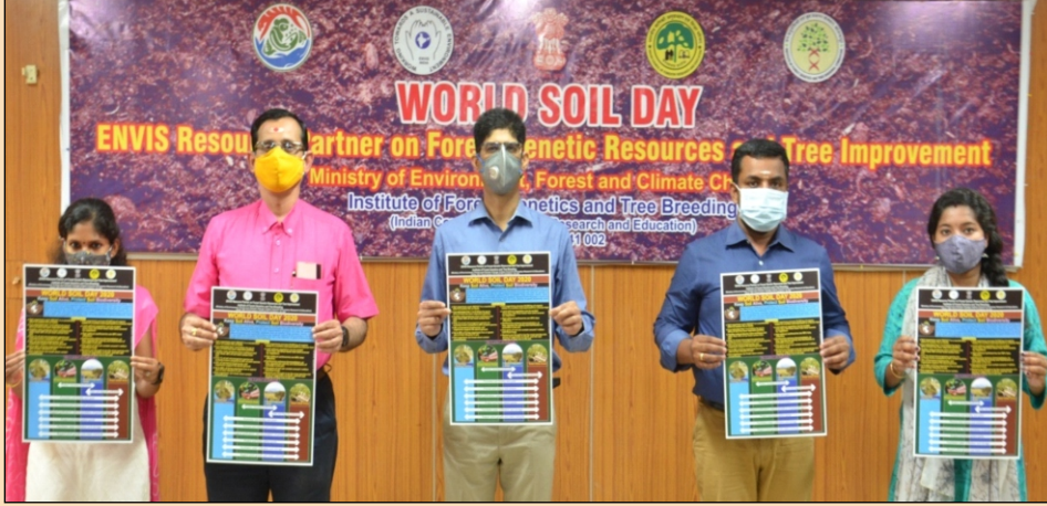
IFGTB, Coimbatore observed World Soil Day