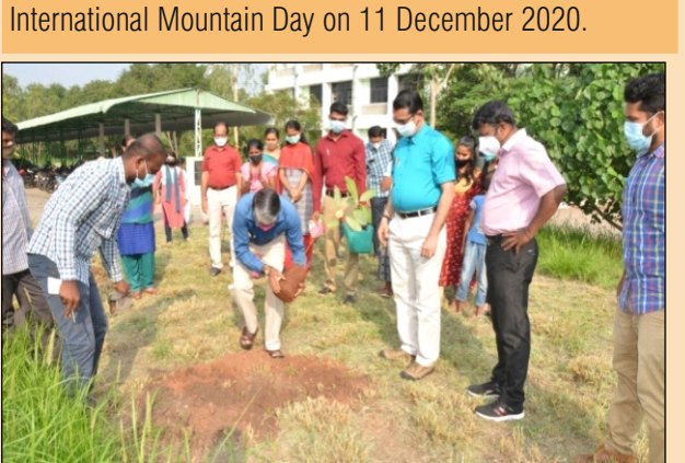
IFGTB, Coimbatore observed International Mountain Day

IFGTB, Coimbatore observed World Soil Day 2020 digitally on 5 December 2020. An awareness event on the theme "Keep Soil Alive, Protect Soil Biodiversity" prescribed by the FAO of the United Nations was organized live through Facebook.