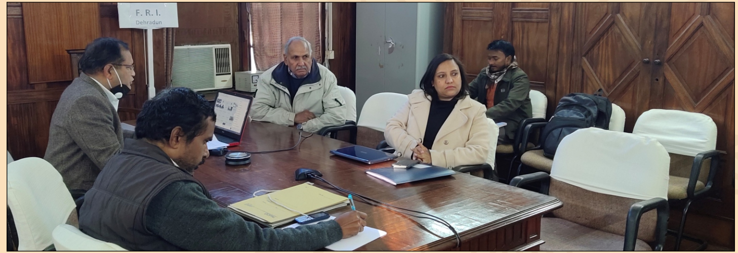
Webinar on Modern Trends in Bamboo Taxonomy