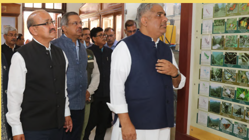
National Forest Insect Collection