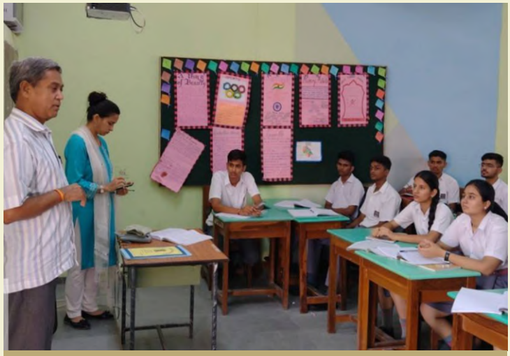
ICFRE-AFRI, Jodhpur organized a lecture on "Environment and Pollution"