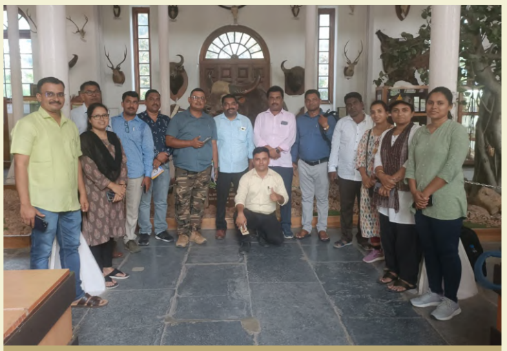
RFO trainees from Social Forestry Wing of Maharashtra Forest Department visited Gass Forest Museum of ICFRE-IFGTB, Coimbatore

Shimla on 31 May 2023. They were apprised about R&D activities of the institute.