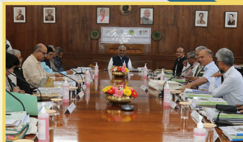
29<sup>th</sup>Annual General Meeting of ICFRE

Hon'ble Minister for Environment, Forest & Climate Change, Shri Bhupender Yadav inaugurated National Forest Insect Collection (NFIC) and Centre of Excellence on Sustainable Land Management in the presence of Shri C.P. Goyal (DGF&SS), MoEF&CC, Shri A.S. Rawat, DG, ICFRE and other members of ICFRE society on 20 May 2023.