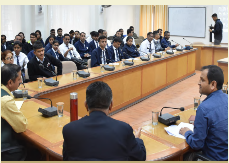
FRO Trainees along with 3 faculty members from Forest Training Academy Haldwani, Uttarakhand visited ICFRE-HFRI, Shimla