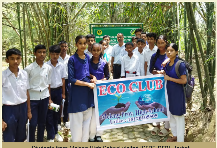
Students from Meleng High School visited ICFRE-RFRI, Jorhat

17 Students from Meleng High School visited ICFRE-RFRI, Jorhat on 11 May 2023 and were briefed about various activities of the Institute.