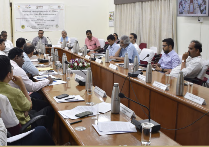
ICFRE-IWST, Bengaluru conducted Workshop on "Sandalwood Cultivation & Its Prospects"