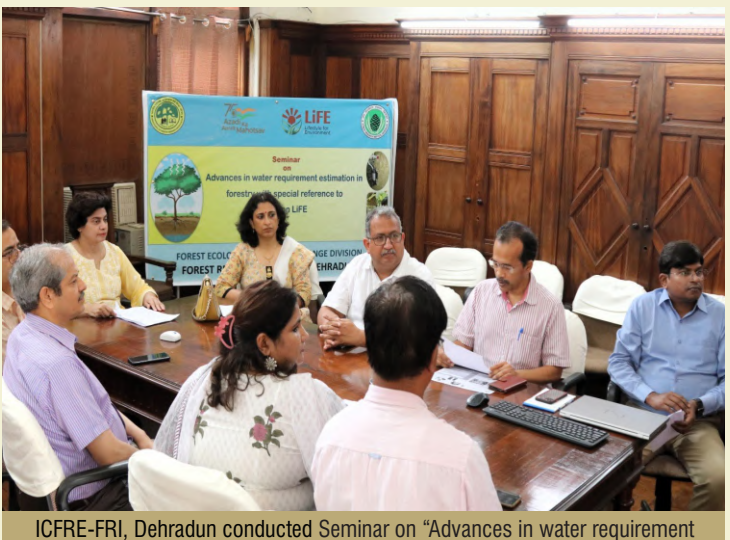
CFRE-FRI, Dehradun conducted Seminar on "Advances in water requirement estimation in forestry with special reference to mission LiFE"