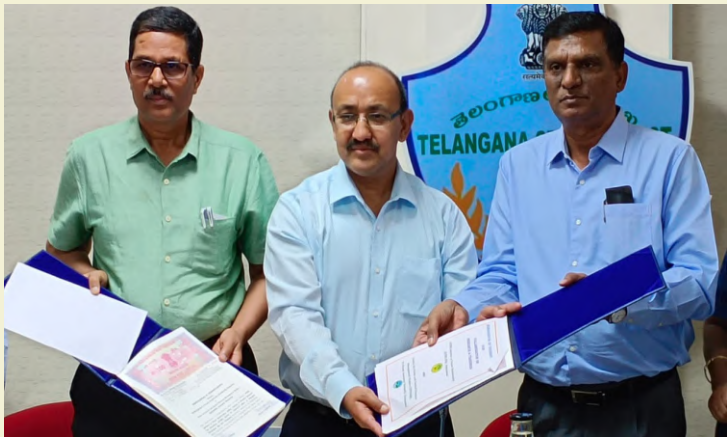
MoU signed between ICFRE-IFB, Hyderabad and Centre for Forest and Natural Resource Management Studies (CEFNARM), Hyderabad under the presence of DG, ICFRE, Dehradun