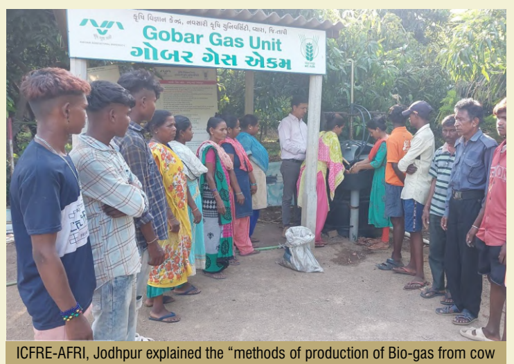
ICFRE-AFRI, Jodhpur explained the "methods of production of Bio-gas from cow dung, its uses to save energy and make profit"