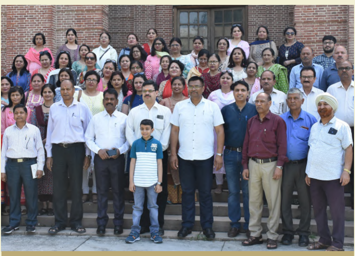
51 primary teachers of Kendriya Vidyalaya from Dehradun and Chandigarh regions visited ICFRE-FRI, Dehradun

51 primary teachers of Kendriya Vidyalaya from Dehradun and Chandigarh regions visited ICFRE-FRI, Dehradun on 16 May 2023.