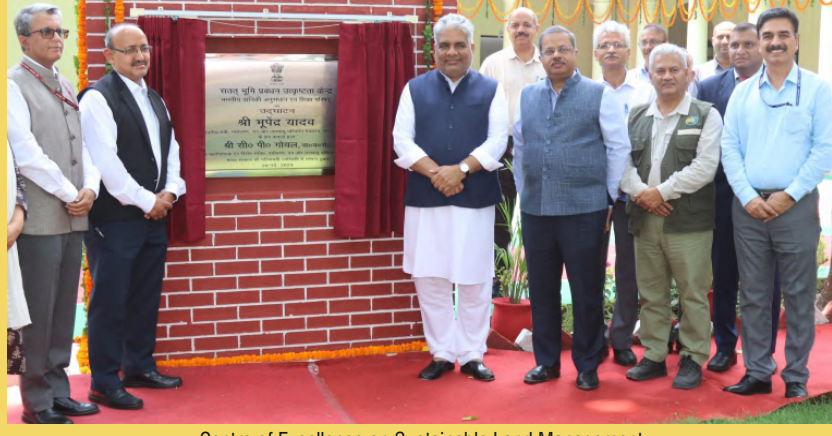
Centre of Excellence on Sustainable Land Management