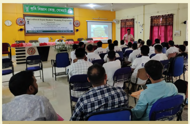
ICFRE-RFRI, Jorhat conducted a presentation on "Forest Based Self Employment Opportunities" at KVK, Jorhat

ICFRE-RFRI, Jorhat conducted a presentation on "Forest Based Self Employment Opportunities" at KVK, Jorhat on 12 May 2023 and exhibited the activities of ICFRE-RFRI, Jorhat.