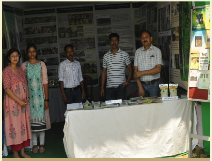
ICFRE-RFRI, Jorhat participated in Exhibition at KVK, Jorhat situated at Koliapani

ICFRE-RFRI, Jorhat participated in Exhibition at KVK, Jorhat situated at Koliapani organized by final year UG Students of Assam Agricultural University undergoing Rural Awareness Work Experience Programme (RAWEP) at ICFRE-RFRI, Jorhat on 12 May 2023. The research and developmental activities of the Institute were showcased at the Exhibition.