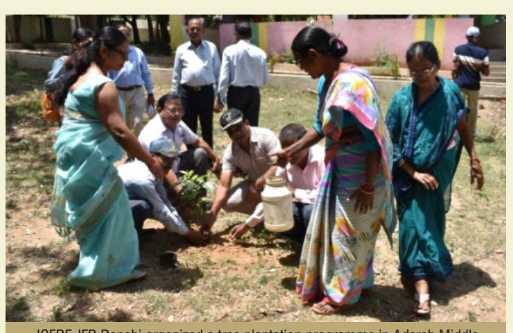
ICFRE-IFP, Ranchi organized a tree plantation programme in Adarsh Middle School, Khunti

ICFRE-IFP, Ranchi organized a tree plantation programme on 10 May 2023 in the Adarsh Middle School, Khunti. About 42 people were participated in the programme.