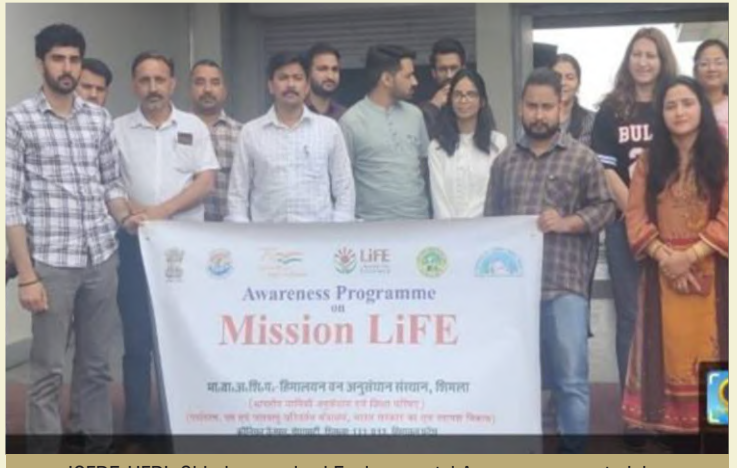
ICFRE-HFRI, Shimla organized Environmental Awareness cum training programme on "Conservation and Propagation of Temperate Medicinal Plants"