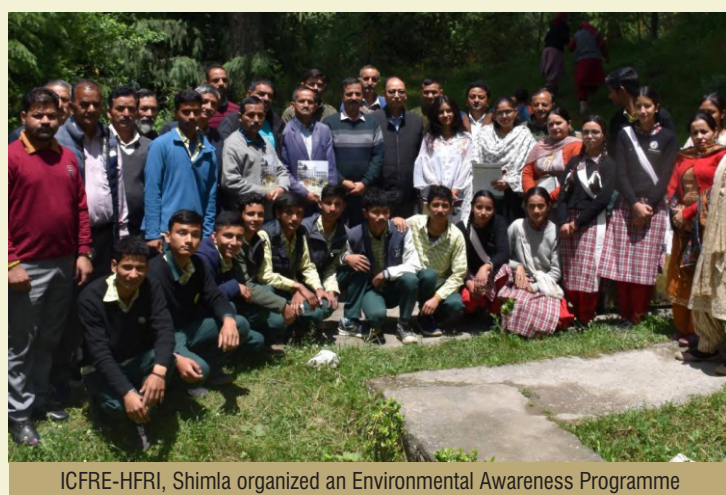
CFRE-HFRI, Shimla organized an Environmental Awareness Programme on E-Waste Reduced