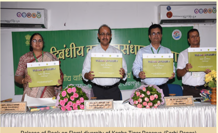
Release of Book on Floral diversity of Kanha Tiger Reserve (Sarhi Range)