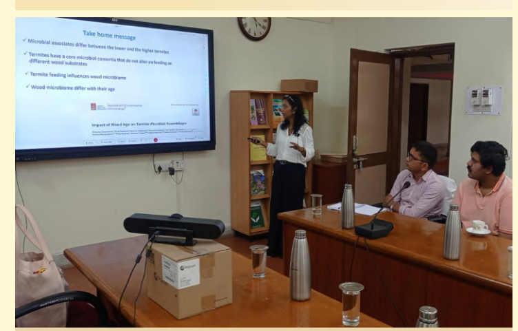
ICFRE-IWST, Bengaluru conducted a lecture on Microbes Matter: Understanding the role of microbes in termite holobiont