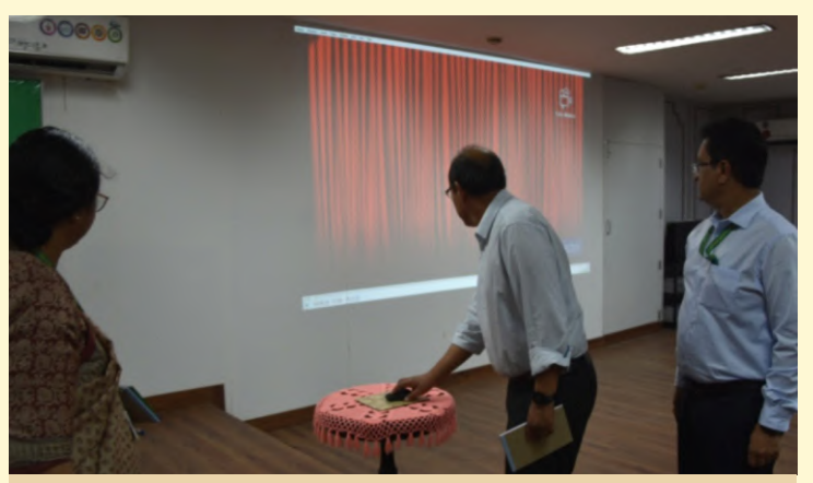
Release of Short Film on Management of Flyash through Forestry Interventions by DG, ICFRE, Dehradun