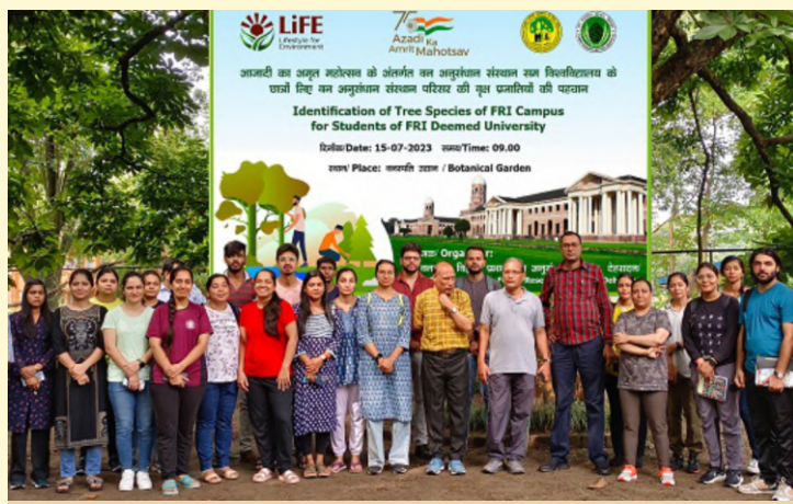
ICFRE-FRI, Dehradun organized an awareness programme to create awareness about biodiversity conservation

Organized an awareness programme to create awareness about biodiversity conservation on 15 July 2023 for the students and research scholars of FRIDU, Dehradun.