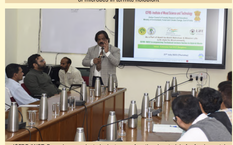
ICFRE-IWST, Bengaluru conducted a lecture on functional materials for fundamental science and various applications