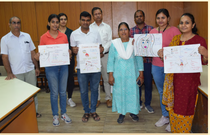
ICFRE-AFRI, Jodhpur organized a poster competition