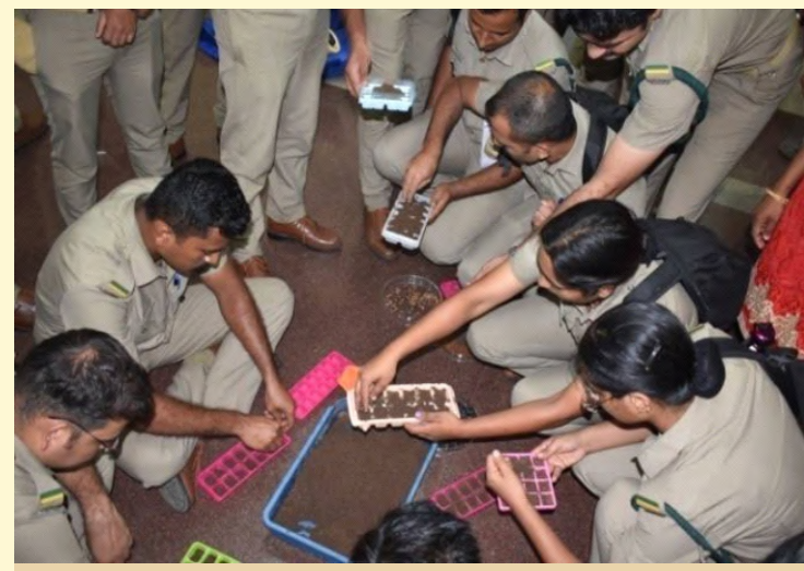
Hands on training on Seed Ball Technology and Seed Balls Sowing