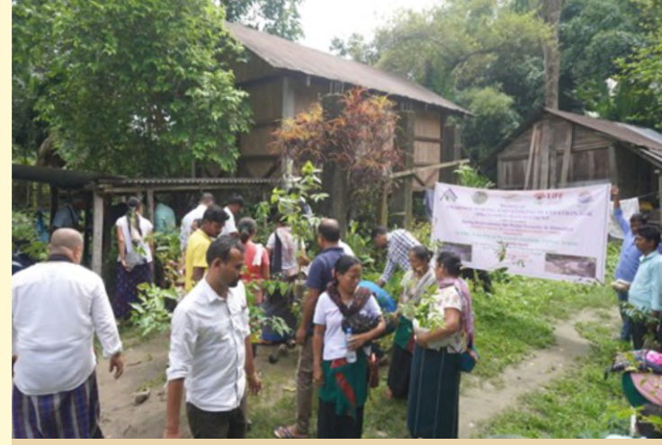
ICFRE-RFRI, Jorhat organized meeting on Awareness Making and Seedling Plantation for Springshed management