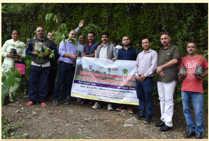
ICFRE-HFRI, Shimla conducted a workshop on Agro-forestry Interventions for Livelihood Enhancement of Rural Community