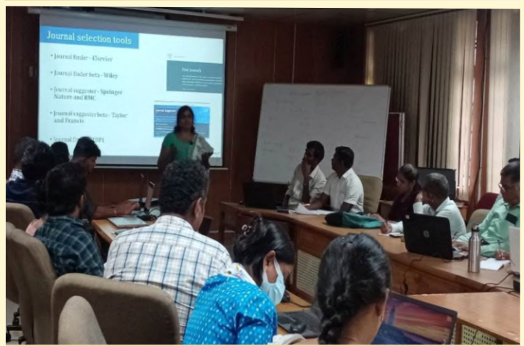
ICFRE-IFGTB, Coimbatore organized a workshop on Artificial Intelligence (AI) tools