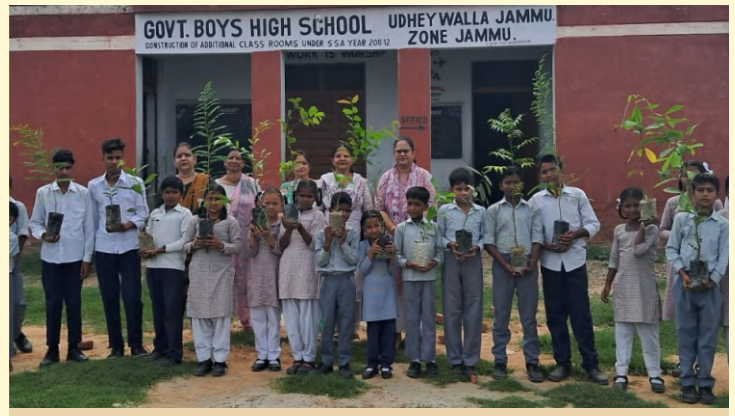
Students from Govt. High School, Udaiwala, Jammu visited ICFRE-HFRI, Shimla

25 students from Government High School, Udaiwala, Jammu visited ICFRE-HFRI, Shimla on 26 July 2023. They were made aware about the plantation technique of important forestry tree species and benefits of tree plantation.