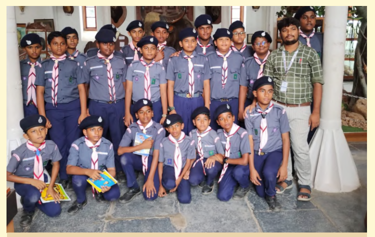
Students from Islamiah Matriculation Higher Secondary School, Coimbatore visited ICFRE-IFGTB, Coimbatore

24 students from Islamiah Matriculation Higher Secondary School, Coimbatore visited Gass Forest Museum of ICFRE-IFGTB, Coimbatore on 11 July 2023 and a talk was delivered to the students on Forest Fires.