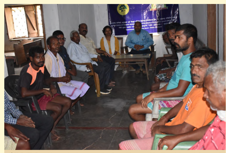
ICFRE-IFP, Ranchi organized two meeting for upliftment of livelihood through forestry in the Tilsiri village, Ghagra (Gumla)