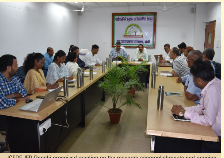
ICFRE-IFP, Ranchi organized meeting on the research accomplishments and ongoing activities of the institute

75 Villagers of Lathao village, Namsai, Arunachal Pradesh