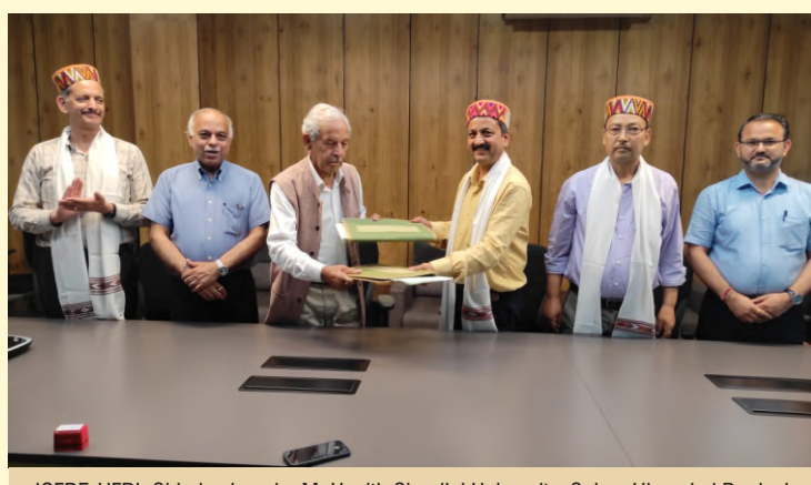
ICFRE-HFRI, Shimla signed a MoU with Shoolini University, Solan, Himachal Pradesh