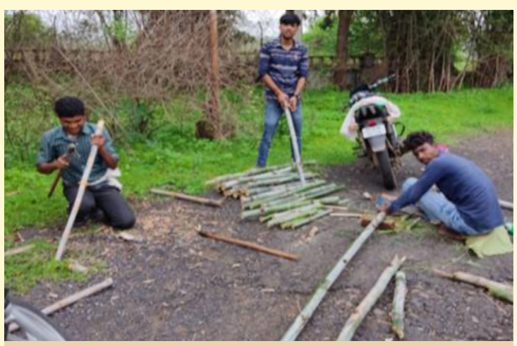
ICFRE-TFRI, Jabalpur conducted a Vocal for Local programme