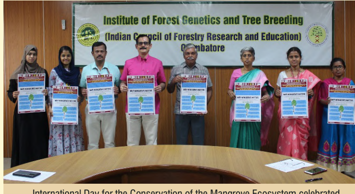
International Day for the Conservation of the Mangrove Ecosystem celebrated by ICFRE-IFGTB, Coimbatore