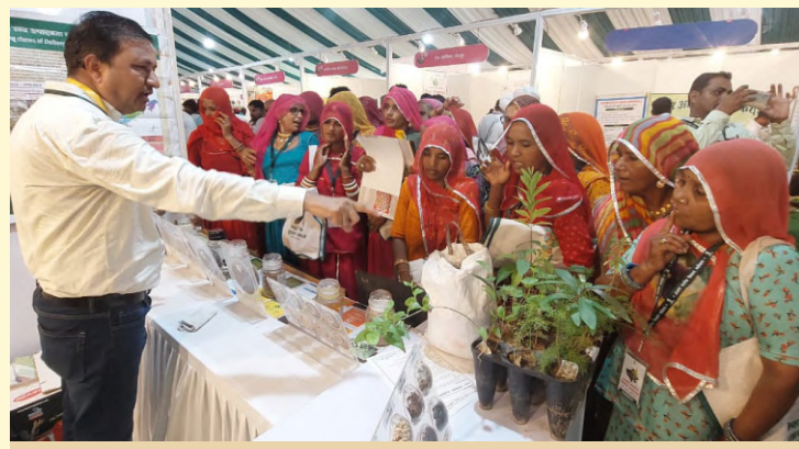
ICFRE-AFRI, Jodhpur participated in District level Exhibition during Kisan Mahotsav