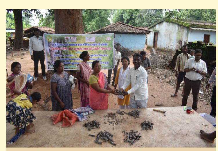
ICFRE-IFP, Ranchi organized a workshop on Cultivation of Kusmi Lac by scientific method