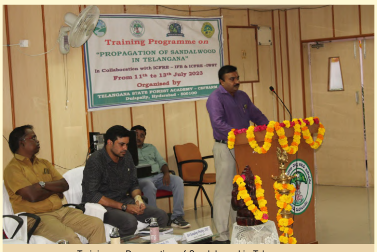
Training on Propagation of Sandalwood in Telangana