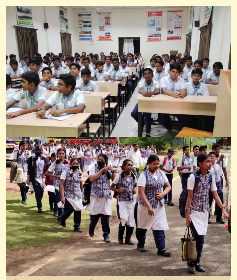
Students from Nirmala Matha Convent Matriculation Higher Secondary School and Nirmala Matha Convent School ICSE, Coimbatore visited ICFRE-IFGTB, Coimbatore

302 students from Nirmala Matha Convent Matriculation Higher Secondary School and Nirmala Matha Convent School ICSE, Coimbatore visited Gass Forest Museum of ICFRE-IFGTB, Coimbatore on 26 July 2023 and a talk was delivered to the students on Urban Forest.