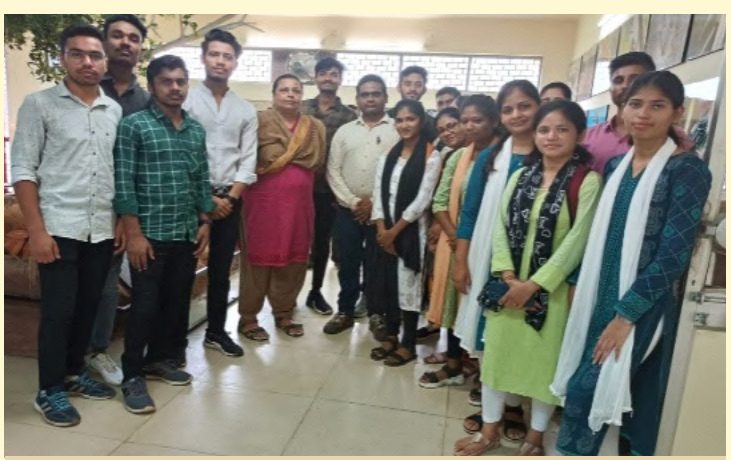
ICFRE-TFRI, Jabalpur demonstrated and elaborated about the Agroforestry activities of the institute to the students

Demonstrated and elaborated about the Agroforestry activities of the institute to the 15 Students of M.Sc. Forestry, JNKVV, Jabalpur (MP) on 10 July 2023.