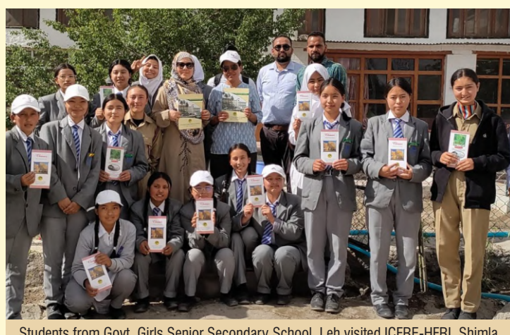
Students from Govt. Girls Senior Secondary School, Leh visited ICFRE-HFRI, Shimla

25 students from Government High School, Udaiwala, Jammu visited ICFRE-HFRI, Shimla on 26 July 2023. They were made aware about the plantation technique of important forestry tree species and benefits of tree plantation.