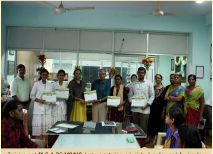
Training on HPLC & GC/MS/MS: Instrumentation, principle, function and Application