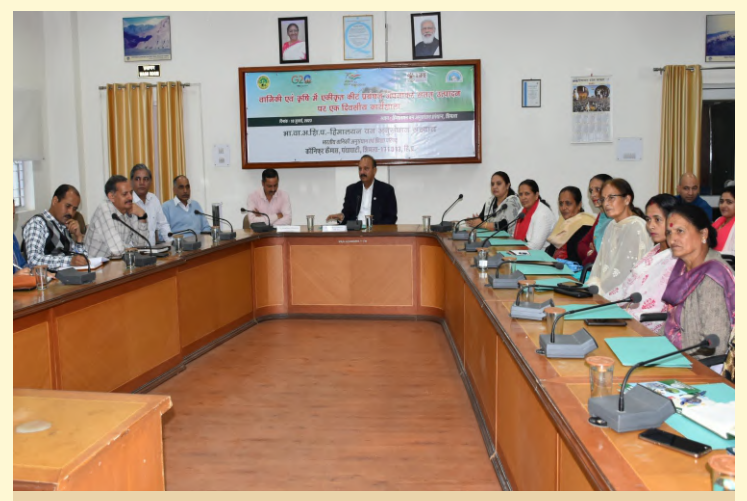
ICFRE-HFRI, Shimla conducted a workshop on Sustainable production by adopting integrated pest management in forestry and agriculture