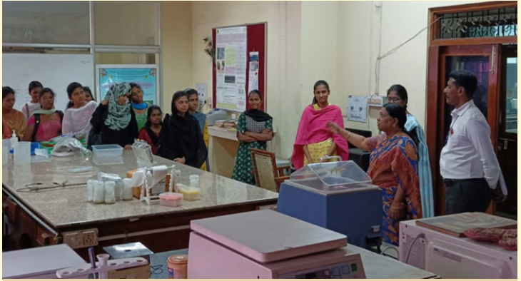
UG Biotechnology students from SNMV College of Arts & Science, Coimbatore visited ICFRE-IFGTB, Coimbatore

24 UG Biotechnology students from SNMV College of Arts & Science, Coimbatore visited ICFRE-IFGTB, Coimbatore on 12 July 2023. Research activities of the institute were explained to the students and were taken to Biotechnology labs, Chemistry & Bioprospecting lab and Gass Forest Museum.