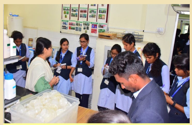
Students of B.Sc Forestry and faculty from Forest College and Research Institute, Mulugu, Hyderabad visited visited ICFRE-IFGTB, Coimbatore

55 students of B.Sc Forestry and 2 faculty from Forest College and Research Institute, Mulugu, Hyderabad visited Tissue Culture lab, Molecular lab, Pathology lab, Xylarium, Wood Workshop, woodworking centre, and Wood Museum lab at IWST-ICFRE campus on 21 August 2023.