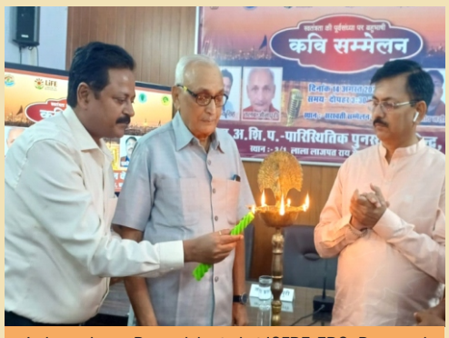
Independence Day celebrated at ICFRE-ERC, Prayagraj