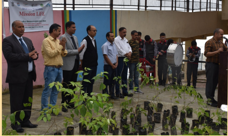
Van Mahotsav 2023 celebrated by ICFRE-HFRI, Shimla