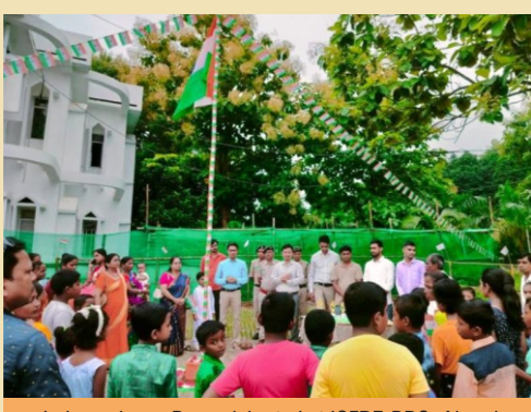
Independence Day celebrated at ICFRE-BRC, Aizawl