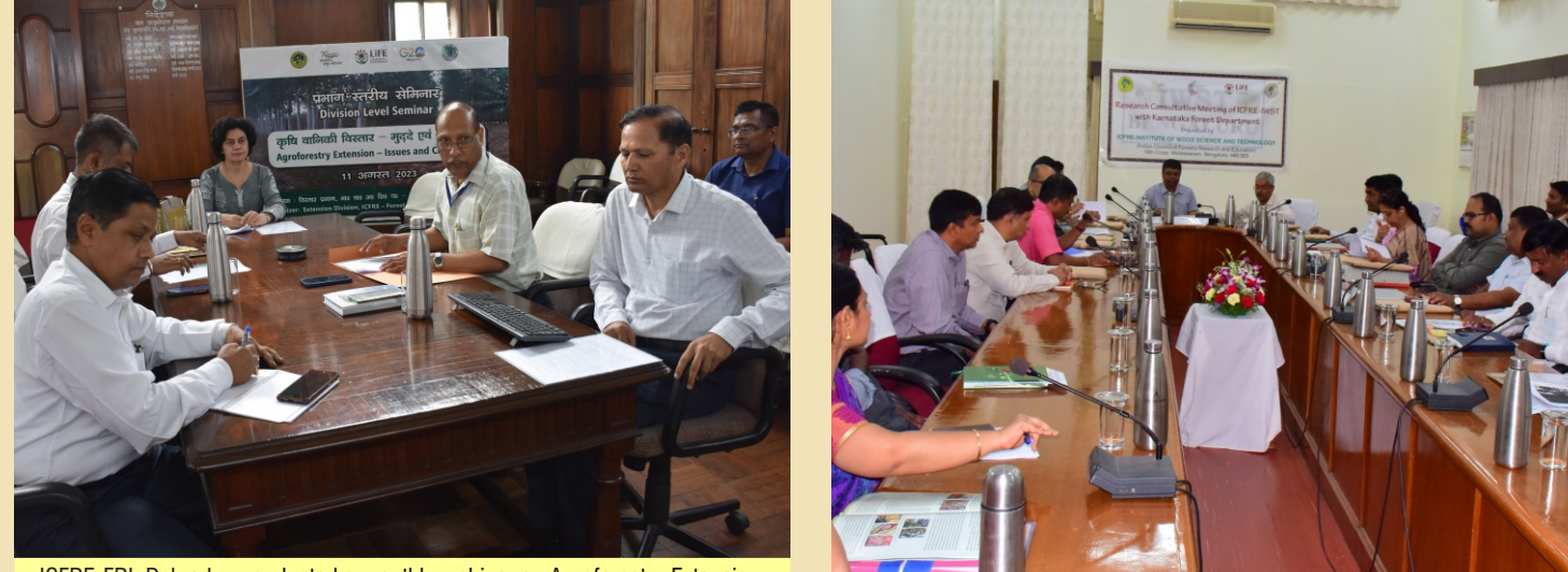
ICFRE-FRI, Dehradun conducted a monthly webinar on Agroforestry Extension: Issues and Challenges

40 participants including Officers, Scientists, officials from ICFRE-IWST and Karnataka Forest Department