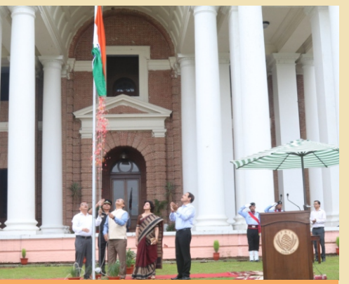
Independence Day celebrated at ICFRE-FRI, Dehradun