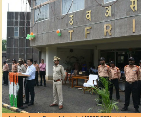
Independence Day celebrated at ICFRE-TFRI, Jabalpur