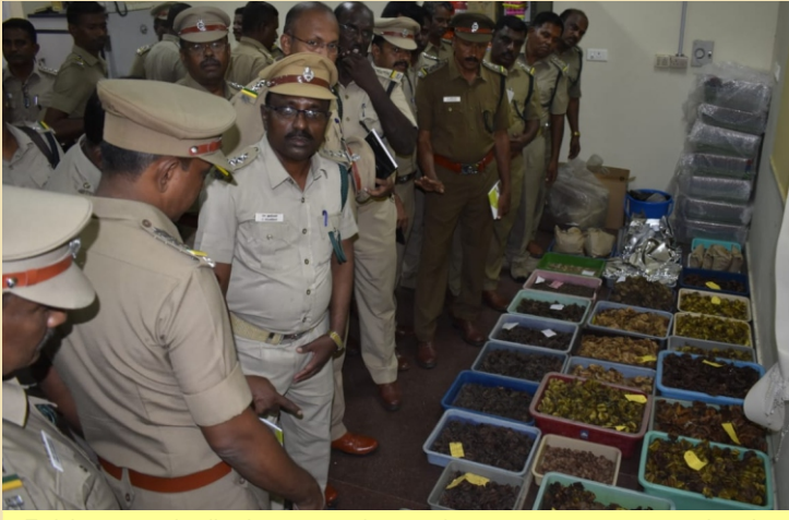
Training on seed collection, processing, seed pretreatment, storage, seed testing and seed certification