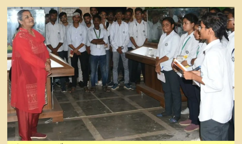
B.Sc. Agriculture 3<sup>rd</sup> year students along with teachers of College of Agriculture, PDKV, Akola (Maharashtra) visited ICFRE-TFRI, Jabalpur