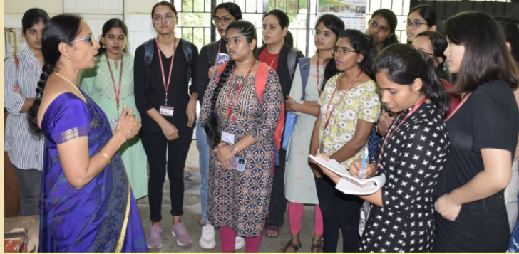
M.Sc Life Science students along with faculty from Mount Carmel College, Bengaluru visited ICFRE-IWST, Bengaluru

32 M.Sc Life Science students along with 2 faculty from Mount Carmel College, Bengaluru visited tissue culture lab, Molecular lab, plant nursery, Xylarium, wood anatomy lab, wood workshop, wood museum and Advance Woodworking Training Centre at ICFRE-IWST, Bengaluru on 4 August 2023.