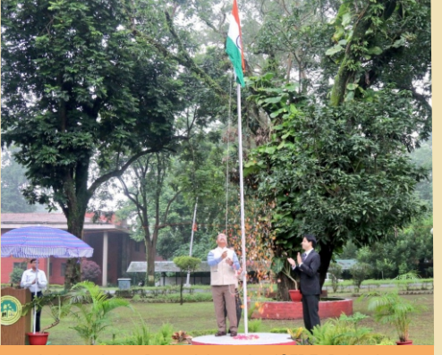
Independence Day celebrated at ICFRE, Dehradun

77<sup>th</sup> Independence Day celebrated on 15 August 2023 by ICFRE, Dehradun, its institutes and centres.