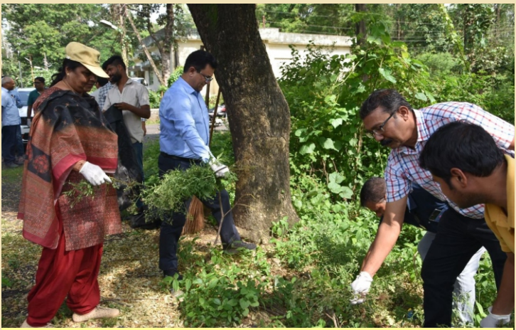
ICFRE-IWST, Bengaluru organized a programme under Swachh Bharat Abhiyan to enhance awareness about the alien, invasive weed-Parthenium