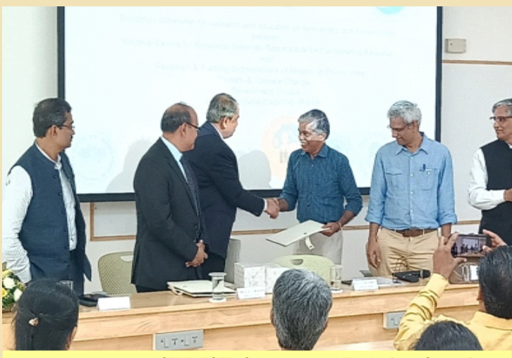
MoU signed between ICFRE-IFGTB, Coimbatore and The National Centre for Biological Sciences (NCBS), Bengaluru

ICFRE, Dehradun signed MoUs with National Centre for Biological Sciences-Tata Institute of Fundamental Research (NCBS-TIFR), Bengaluru and Faculty of Forestry, Kasetsart University, Bangkok, Thailand.