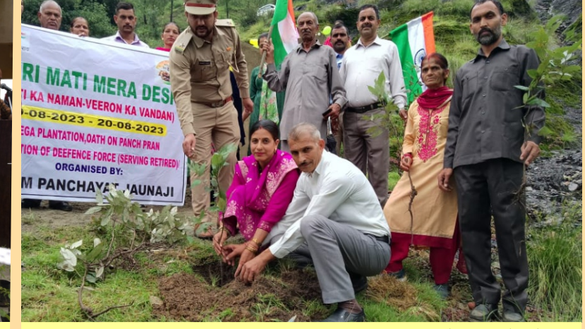
ICFRE-HFRI, Shimla organized a programme under the theme मेरी माटी मेरा देश