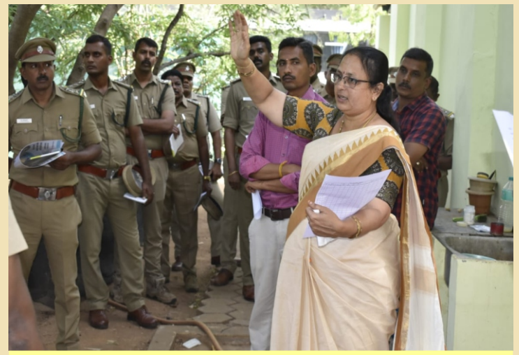
Training on Plus tree identification and selection procedure