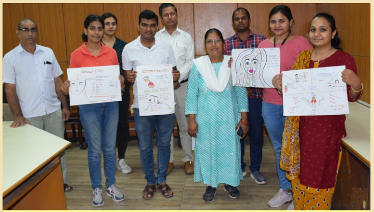
ICFRE-AFRI, Jodhpur organized a programme on Importance of Sanskrit Language

Organized a programme on Importance of Sanskrit Language on 4 August 2023. Scientists, officers, technical staff, research scholars of the institute participated in the programme.