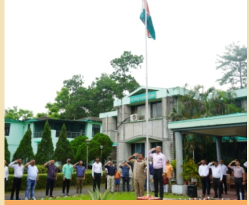
Independence Day celebrated at ICFRE-RFRI, Jorhat