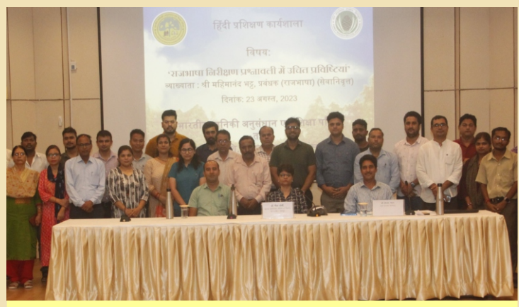
ICFRE, Dehradun organized a Hindi Workshop