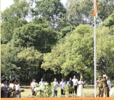
Independence Day celebrated at ICFRE-IWST, Bengaluru