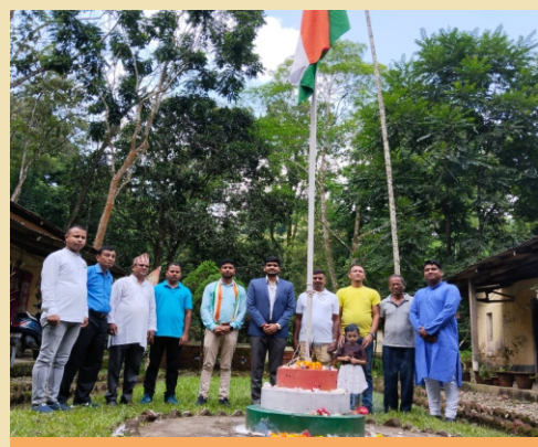
Independence Day celebrated at ICFRE-IFP, Ranchi