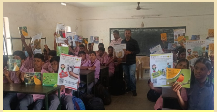
Students from Govt. High School Kanuvai, Coimbatore visited ICFRE-IFGTB, Coimbatore