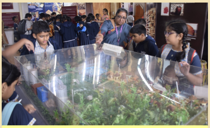
Students of Grade V along with 4 faculty members from M.E.S. Kishore Kendra, Malleswaram, Bengaluru visited ICFRE-IWST, Bengaluru

110 students of Grade V along with 4 faculty members from M.E.S. Kishore Kendra, Malleswaram, Bengaluru visited plant nursery, wood museum and took a nature walk in ICFRE-IWST campus on 1 Aug 2023.