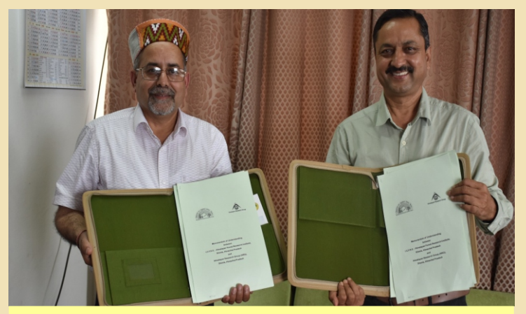
ICFRE-HFRI, Shimla, signed a MoU with Himalayan Research group, Shimla

ICFRE-HFRI, Shimla, signed a MoU with Himalayan Research group, Shimla on 9 August 2023 to work together to ensure active participation of local communities in forestry innovations and technology transfer in an eco-friendly manner and be partner in bringing their prosperity.