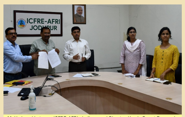
MoU signed between ICFRE-AFRI, Jodhpur and Director, Kerala Forest Research Institute (KSCSTE-KFRI) Peechi Kerala

An MoU was signed between ICFRE-AFRI, Jodhpur and Director, Kerala Forest Research Institute (KSCSTE-KFRI) Peechi Kerala for carrying out genetic diversity study using SSR DNA markers in sandalwood ( Santalum album L) under the AICRP Conservation, Improvement, Management And Promotion of Sandal Wood ( Santalum album L.) Cultivation in India on 3 August 2023.