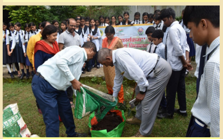
ICFRE-IFP, Ranchi organized an environment awareness programme