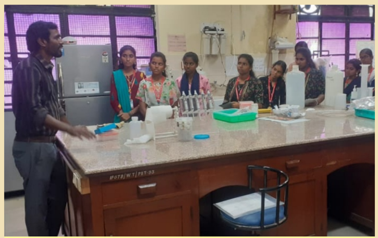
Students and staff (Biochemistry & Biotech) from PGP College of Arts and Science, Namakkal visited ICFRE-IFGTB, Coimbatore

30 students of M.Sc Agri from Tamil Nadu Agricultural University, Coimbatore visited ICFRE-IFGTB, Coimbatore on 31 August 2023 for learning the hybridization techniques in tree crops.