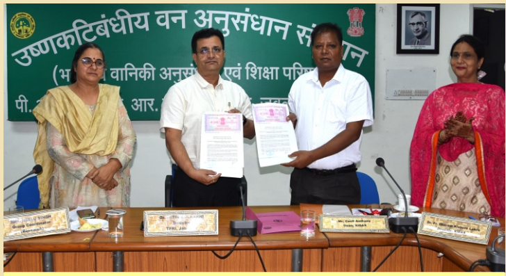
MoU signed between ICFRE-TFRI, Jabalpur and Xavier Institute of Development Action and Studies (XIDAS), Jabalpur

ICFRE-TFRI, Jabalpur signed two MoU with Xavier Institute of Development Action and Studies (XIDAS), Jabalpur and Government Science College, Jabalpur on 1 August 2023.