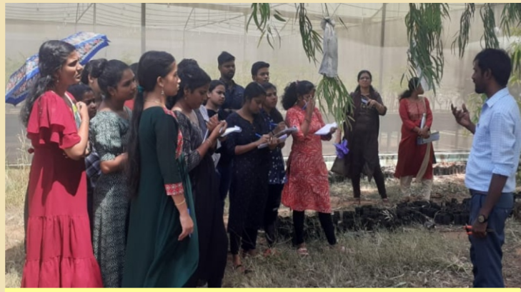
PG Botany students from Sree Narayana College, Thiruvananthapuram visited ICFRE-IFGTB, Coimbatore

25 PG Botany students from Sree Narayana College, Thiruvananthapuram visited ICFRE-IFGTB, Coimbatore on 3 August 2023. Research activities of the institute were also explained to the students.